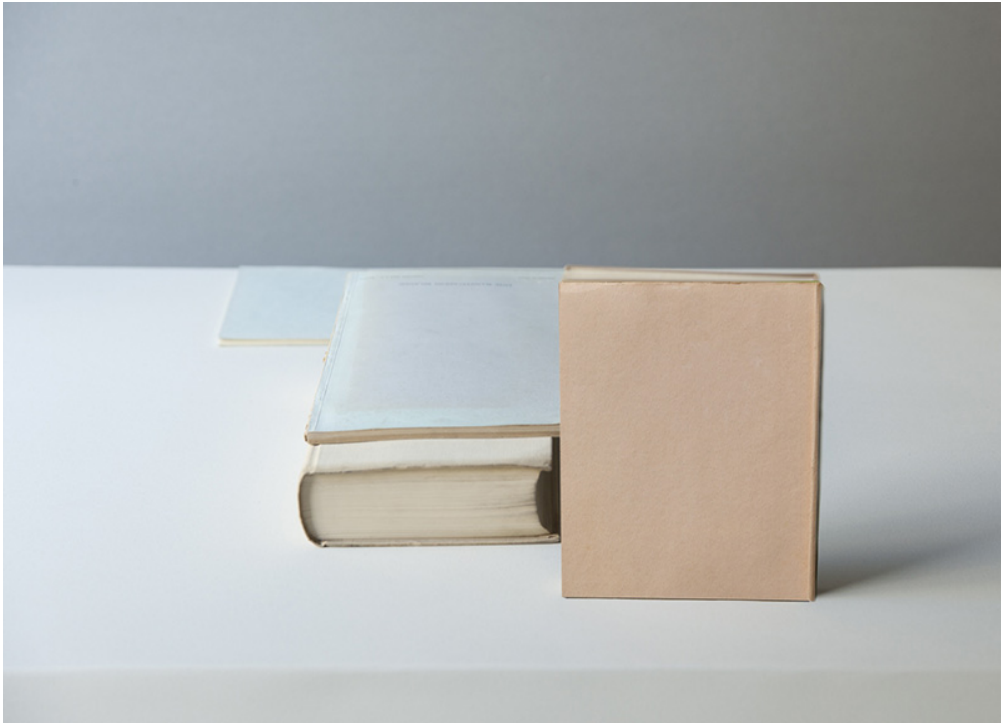
Standing Pink Book, 2022 archival pigment print, 17 7/8 x 22 7/8 inches framed, edition of 7