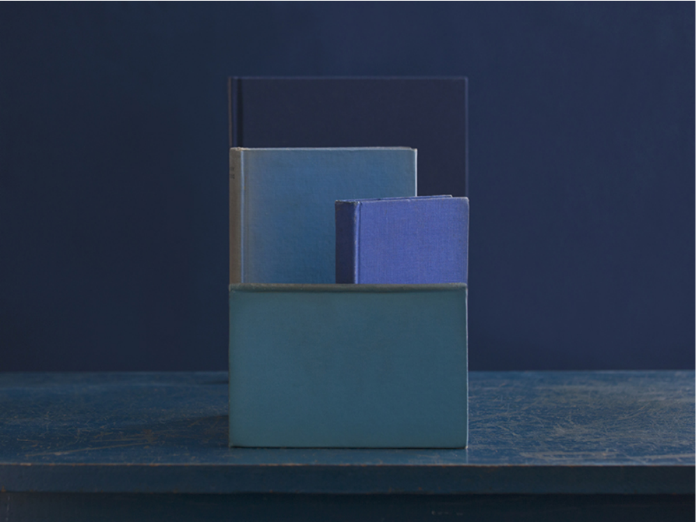
Blue Books #13, 2021 archival pigment print, 17 7/8 x 22 7/8 inches framed, edition of 10