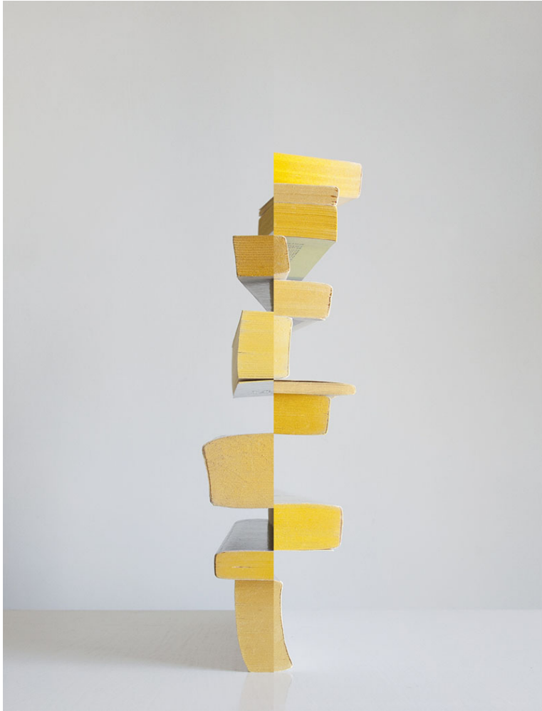
Yellow Stack , 2021 archival pigment print, 22 7/8 x 17 7/8 inches framed, edition of 7