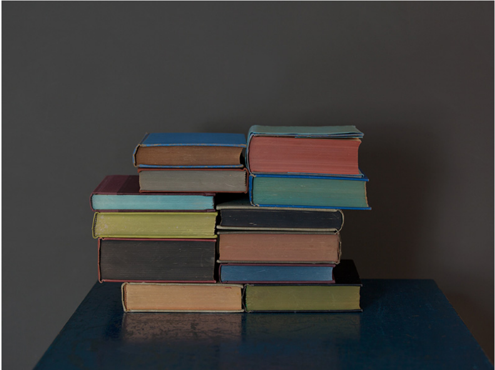
Reading November #8, 2021 archival pigment print, 17 7/8 x 22 7/8 inches framed, edition of 7