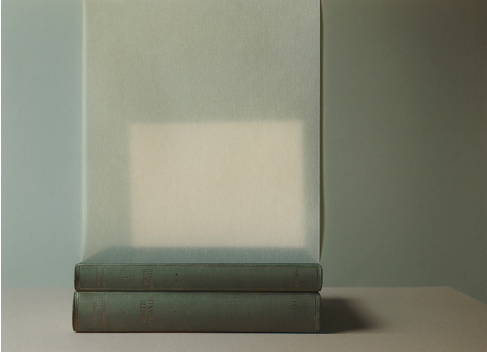
Roberto Longhi, 2022 archival pigment print, 17 7/8 x 22 7/8 inches framed, edition of 7