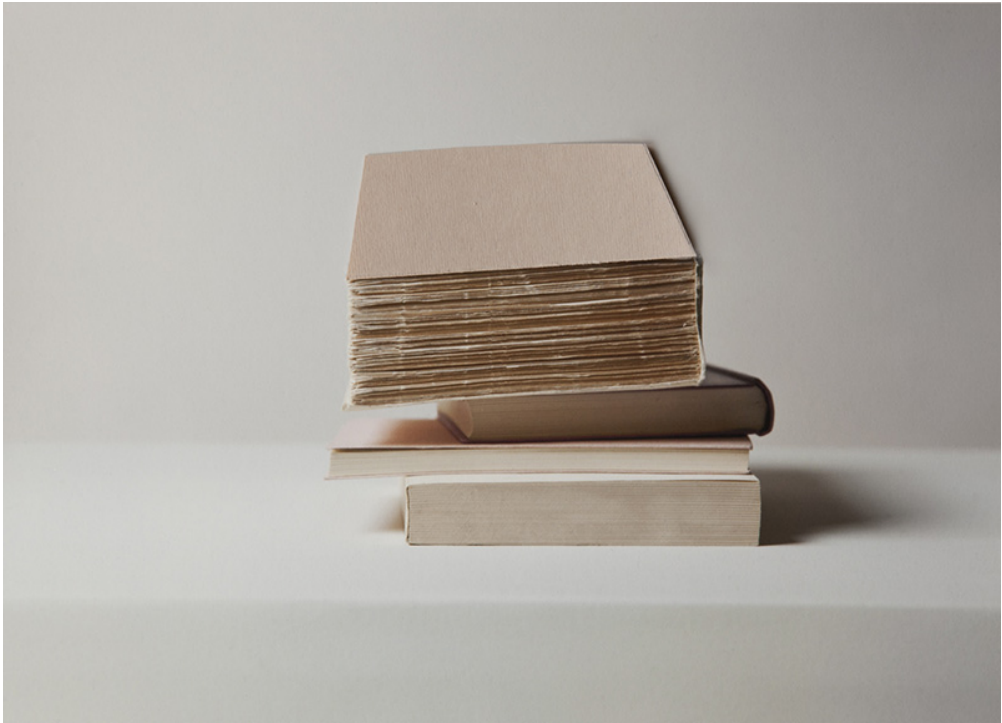
Pink Book on Top , 2022 archival pigment print, 17 7/8 x 22 7/8 inches framed, edition of 7