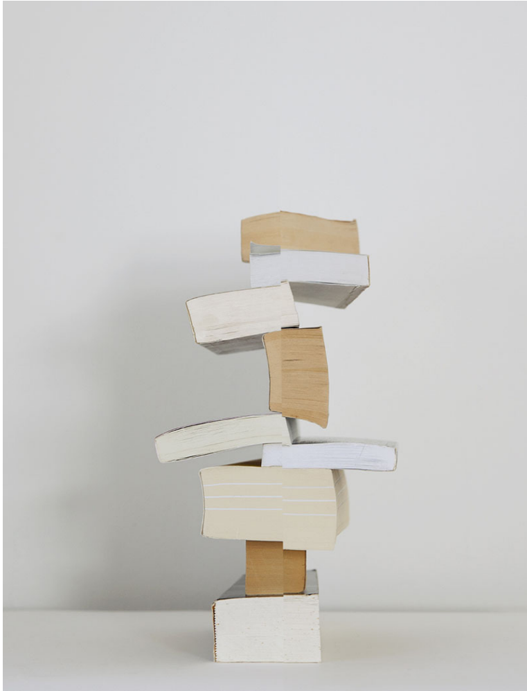
Wood Block Stack, 2022 archival pigment print, 22 7/8 x 17 7/8 inches framed, edition of 7