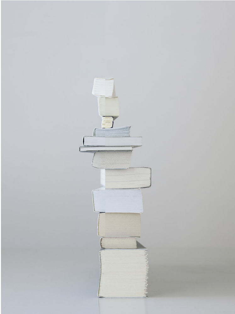
57 Split Stack, 2022 archival pigment print, 22 7/8 x 17 7/8 inches framed, edition of 7