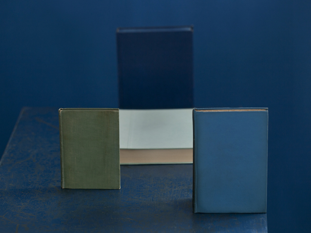
Blue Books #12, 2021 archival pigment print, 17 7/8 x 22 7/8 inches framed, edition of 10