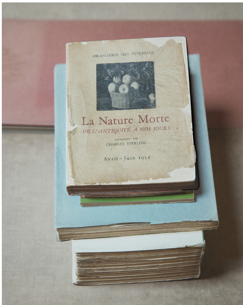
La Nature Morte , 2022 archival pigment print, 22 7/8 x 17 7/8 inches framed, edition of 7