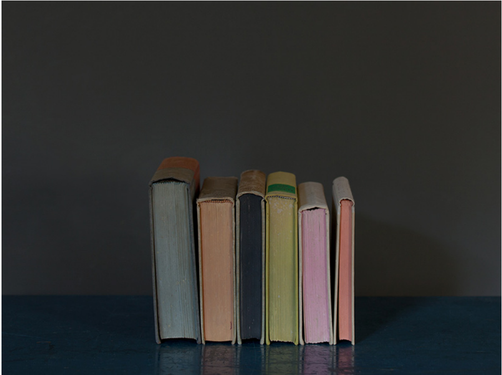
Reading November #9, 2021 archival pigment print, 17 7/8 x 22 7/8 inches framed, edition of 7