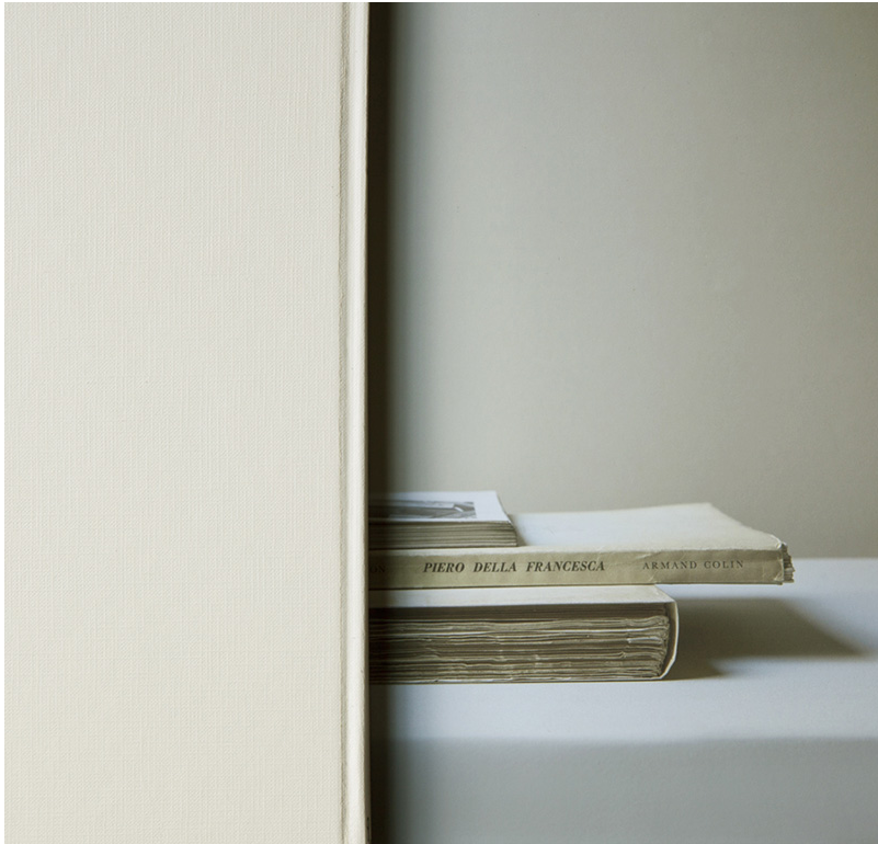
Piero della Francesca, 2022 archival pigment print, 22 7/8 x 17 7/8 inches framed, edition of 7