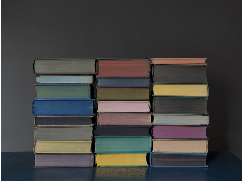
Reading November #12, 2021 archival pigment print, 17 7/8 x 22 7/8 inches framed, edition of 7