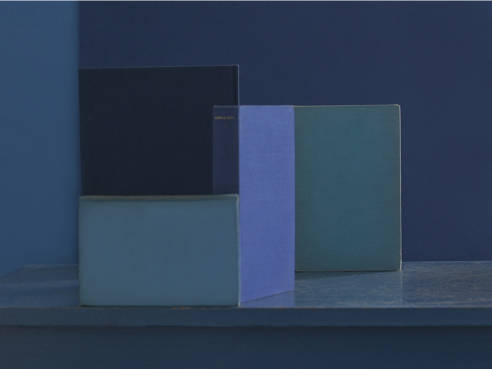
Blue Books #14, 2021 archival pigment print, 17 7/8 x 22 7/8 inches framed, edition of 10