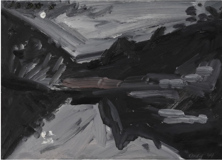
Lois Dodd Moon at Hogback, 1994 oil on aluminum 5 x 7 inches