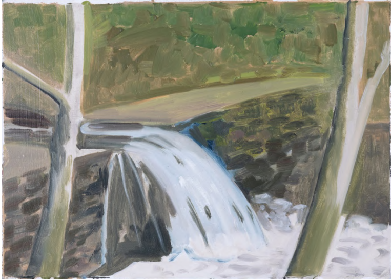
Lois Dodd Zager's Waterfall , 1990 oil on aluminum 5 x 7 inches