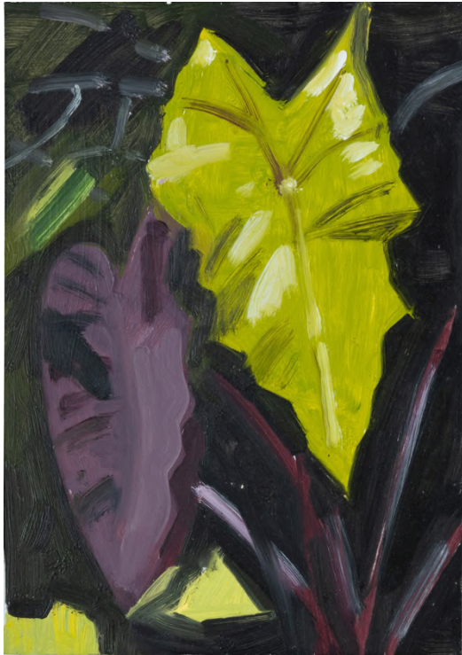
Lois Dodd Caladium , 1998 oil on aluminum 7 x 5 inches