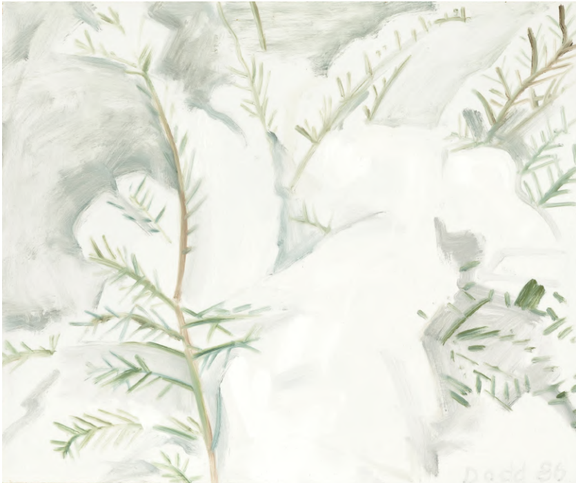
Lois Dodd Snowy Branch , 1986 oil on Masonite 10 x 12 inches