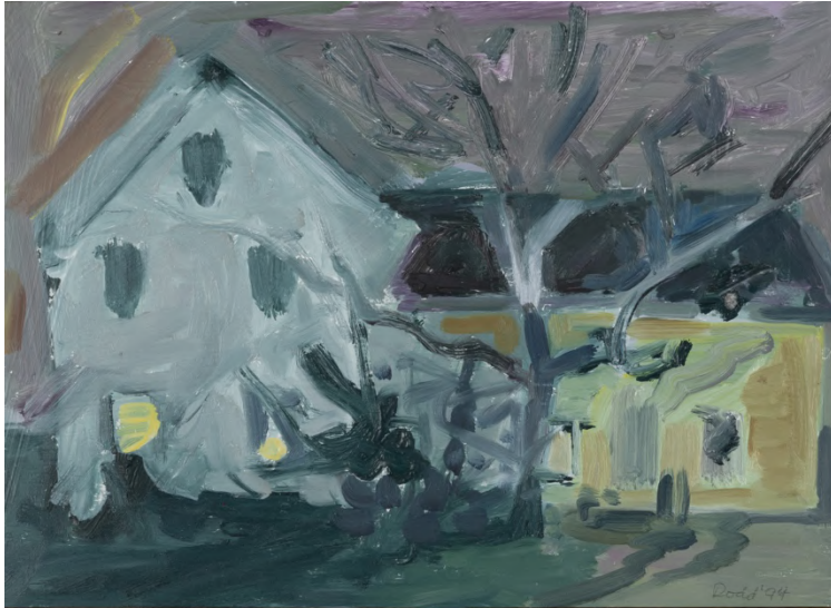
Lois Dodd Johnson, VT, 1994 oil on aluminum 5 x 7 inches