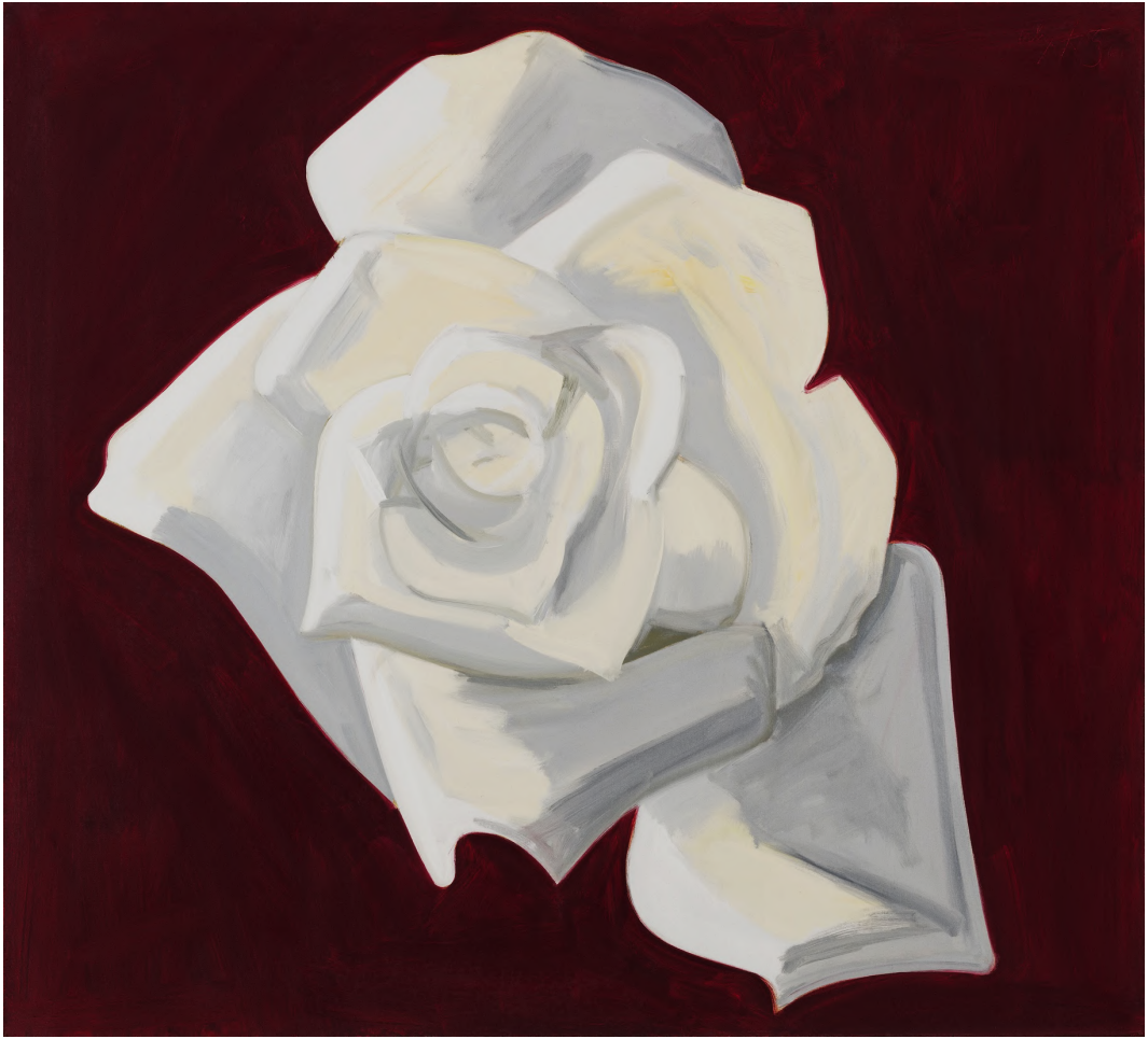
Alex Katz Untitled (Rose) , 1966 oil on canvas 50 x 50 inches