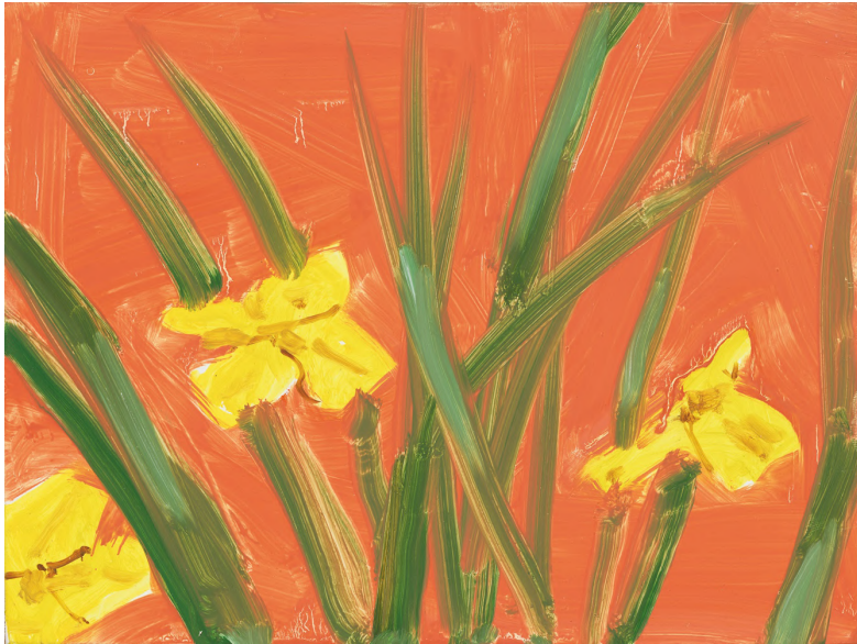
Alex Katz Iris Study 6, 2019 oil on board 9 x 12 inches