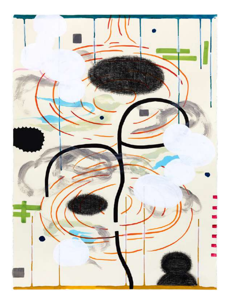
The Road We Took, 2019 acrylic, ink and charcoal on paper 30 x 22 1/4 inches $3,400