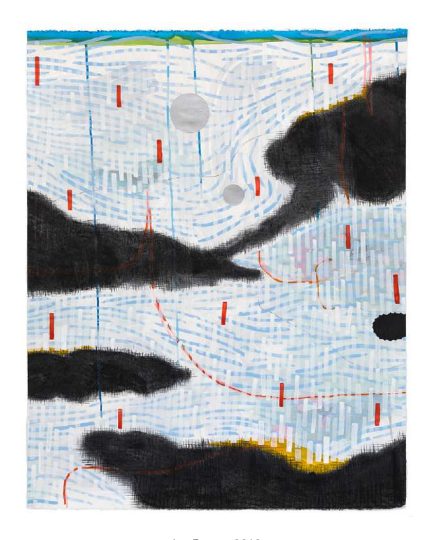
Icy Dream, 2019 acrylic, ink, charcoal and flashe on paper 30 1/4 x 24 inches $3,400