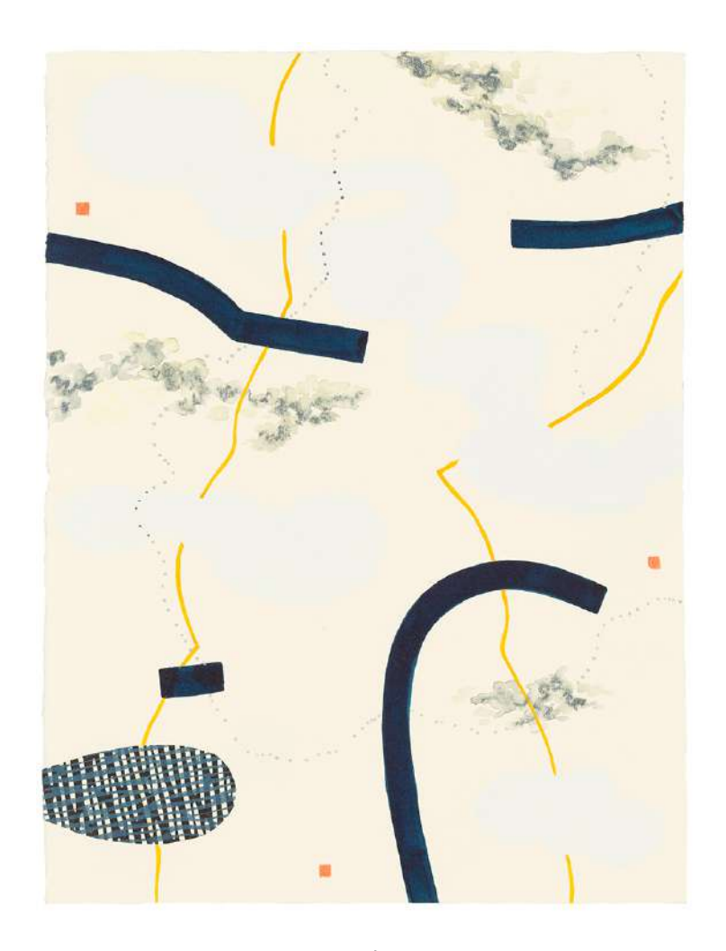
Lemon Lick I, 2020 ink, acrylic and collaged linocut on paper 15 x 11 1/4 inches $1,800