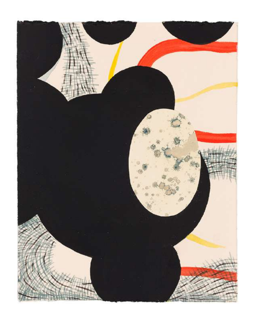
Oculus, 2020 ink, acrylic, flashe and collaged cyanotype on paper 8\ 3/8 \times 6\ 1/2 inches $1,000