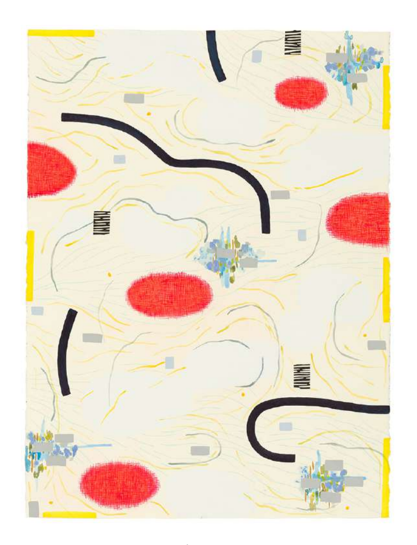
Solstice, 2020 30 \times 22 \text{ 1/4} inches ink, acrylic, flashe, conté and collaged linocut on paper $3,400