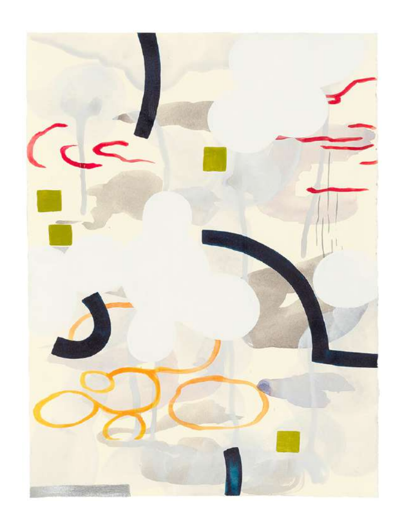
Cool Cacophony II, 2020 ink and acrylic on paper 15 x 11 1/4 inches $1,800