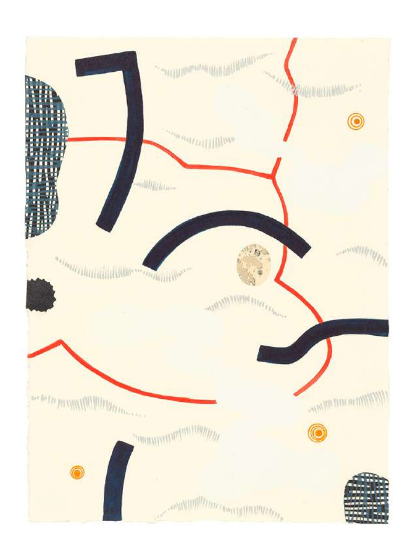
Salt Air I, 2020 ink, acrylic, collaged linocut, sandpaper and cyanotype on paper 15 \times 11 \, 1/4 inches $1,800