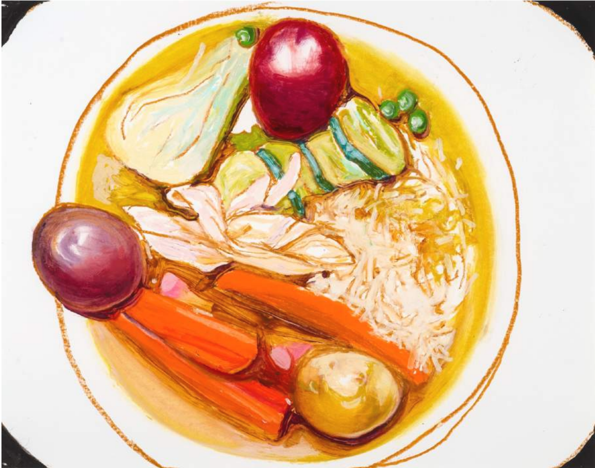
Untitled (Chicken Soup, Carrots, Fennel, Potatoes), 2022, oil stick on paper, 19 x 24 inches