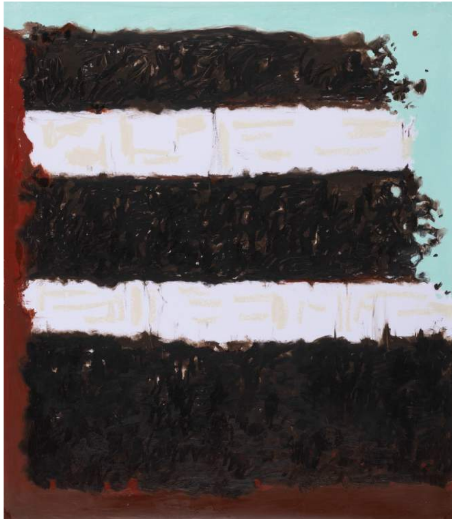
Untitled (Birthday Cake, Red Devil), 2023, oil stick on paper, 47 1/2 x 36 inches