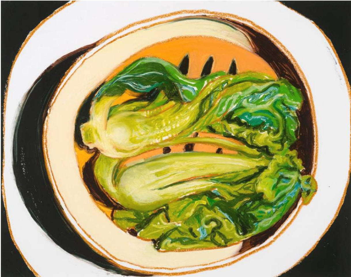
Untitled (Bok Choy, Steamer), 2020, oil stick on paper, 19 x 24 inches