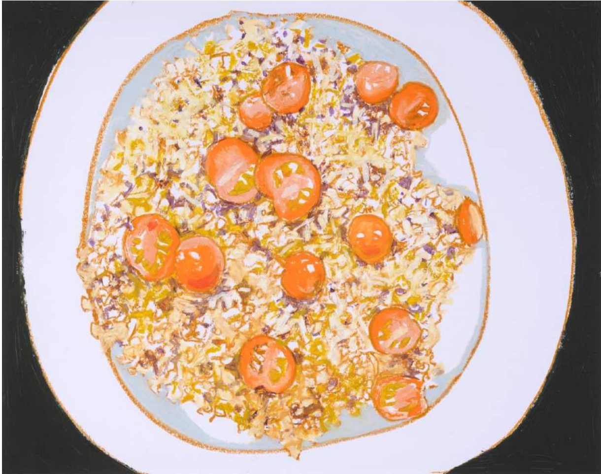
Untitled (Tomato, Quinoa), 2021, oil stick on paper, 19 x 24 inches