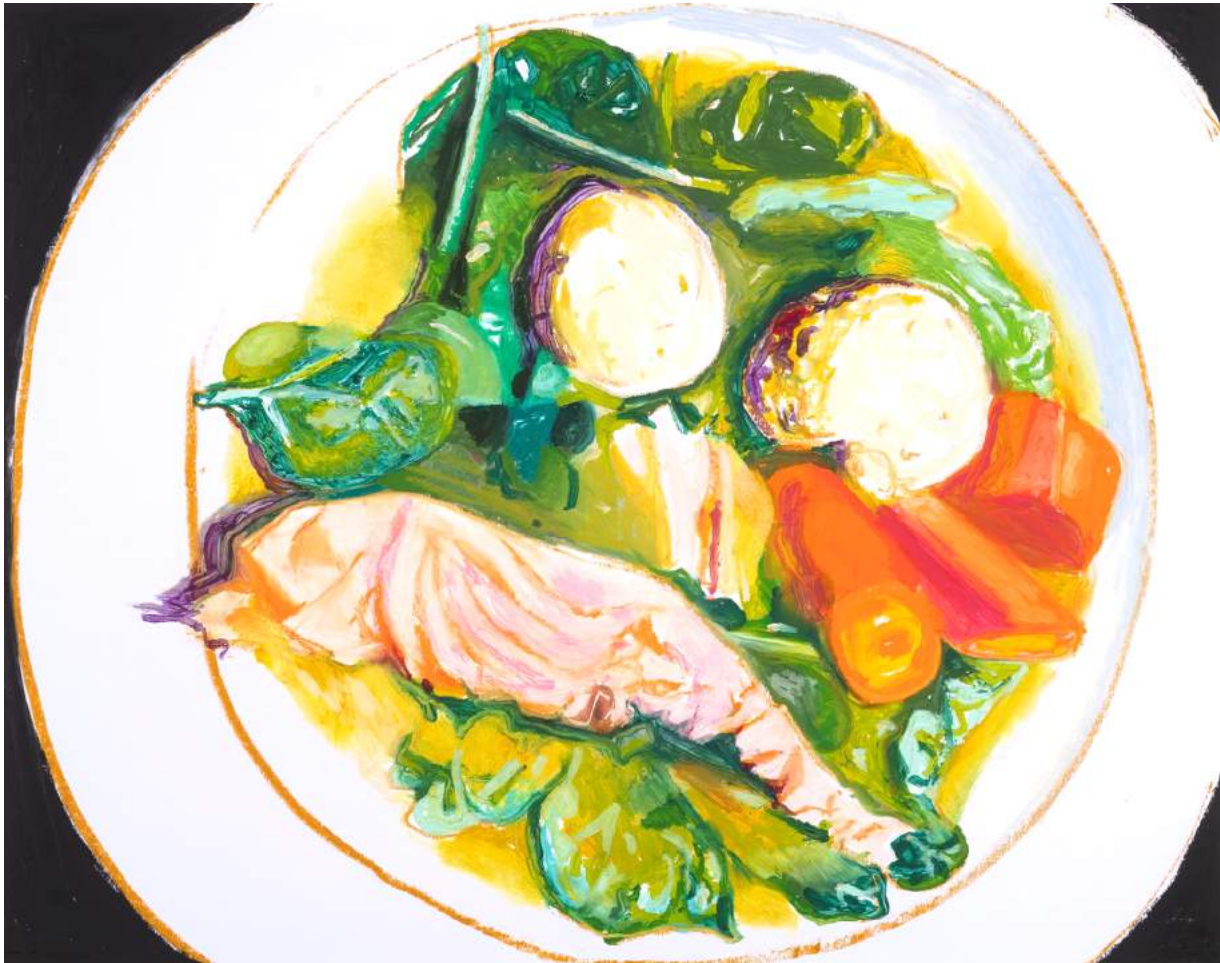
Untitled (Soup, Salmon, Matzoh Balls), 2023, oil stick on paper, 19 x 24 inches