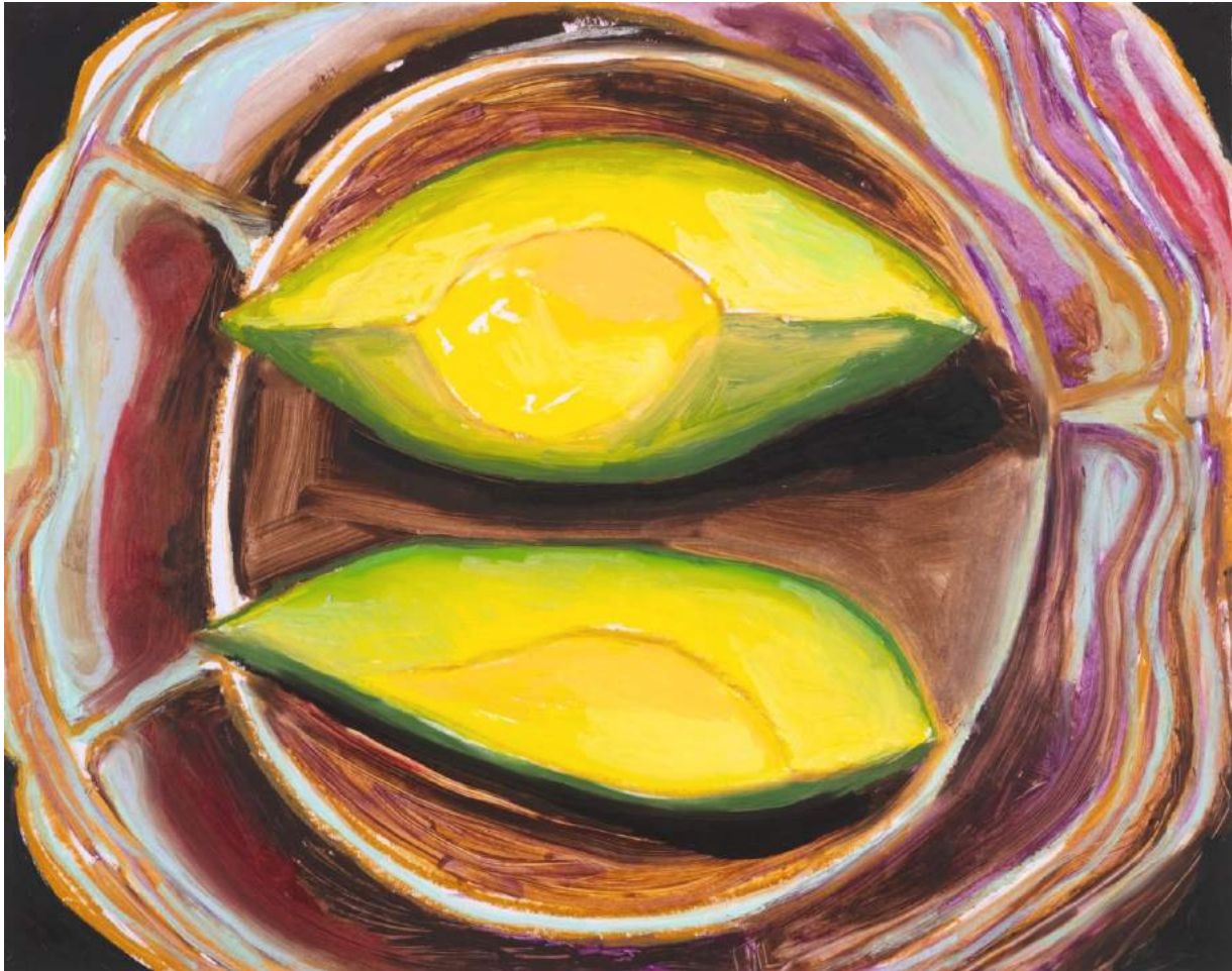
Untitled (Avocado, Halves), 2024, oil stick on paper, 19 x 24 inches