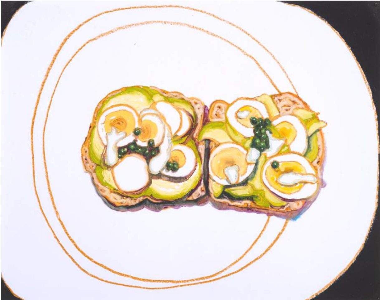
Untitled (Toast, Avocado, Eggs) , 2022, oil stick on paper, 19 x 24 inches