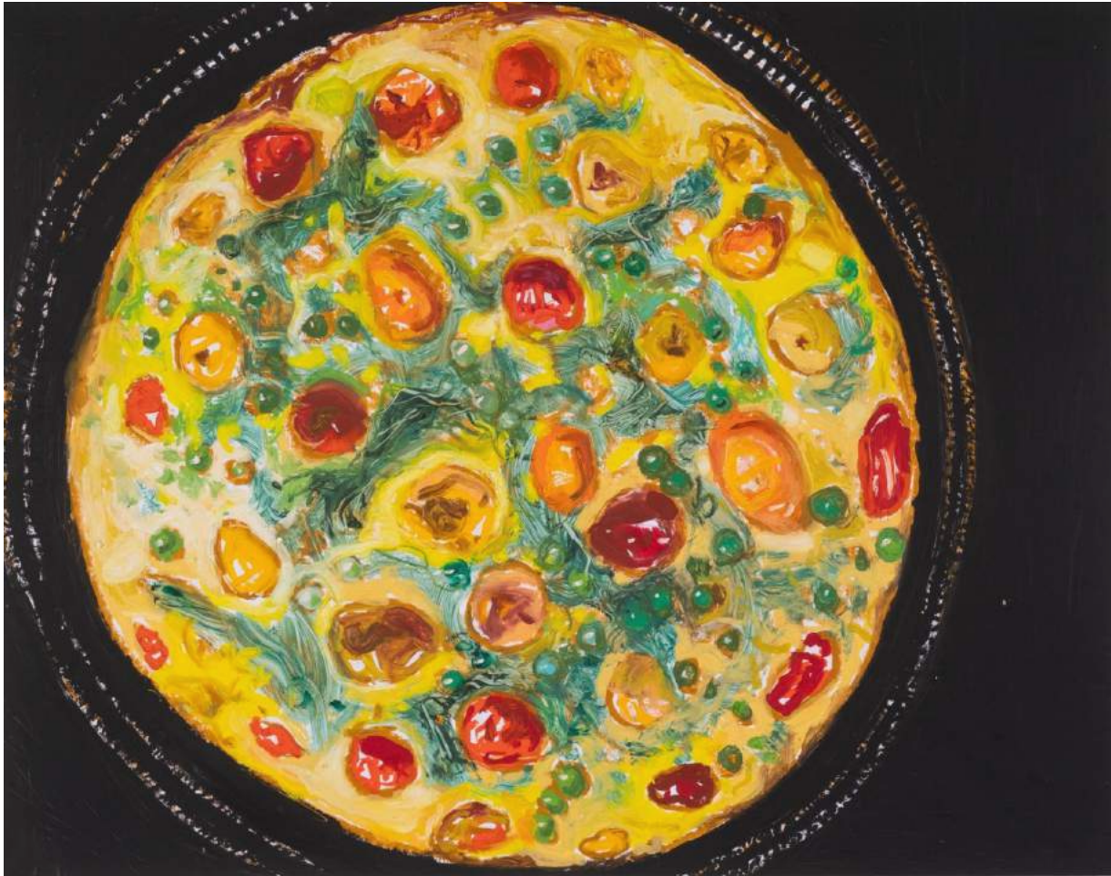
Untitled (Frittata, Tomatoes) , 2020, oil stick on paper, 19 x 24 inches