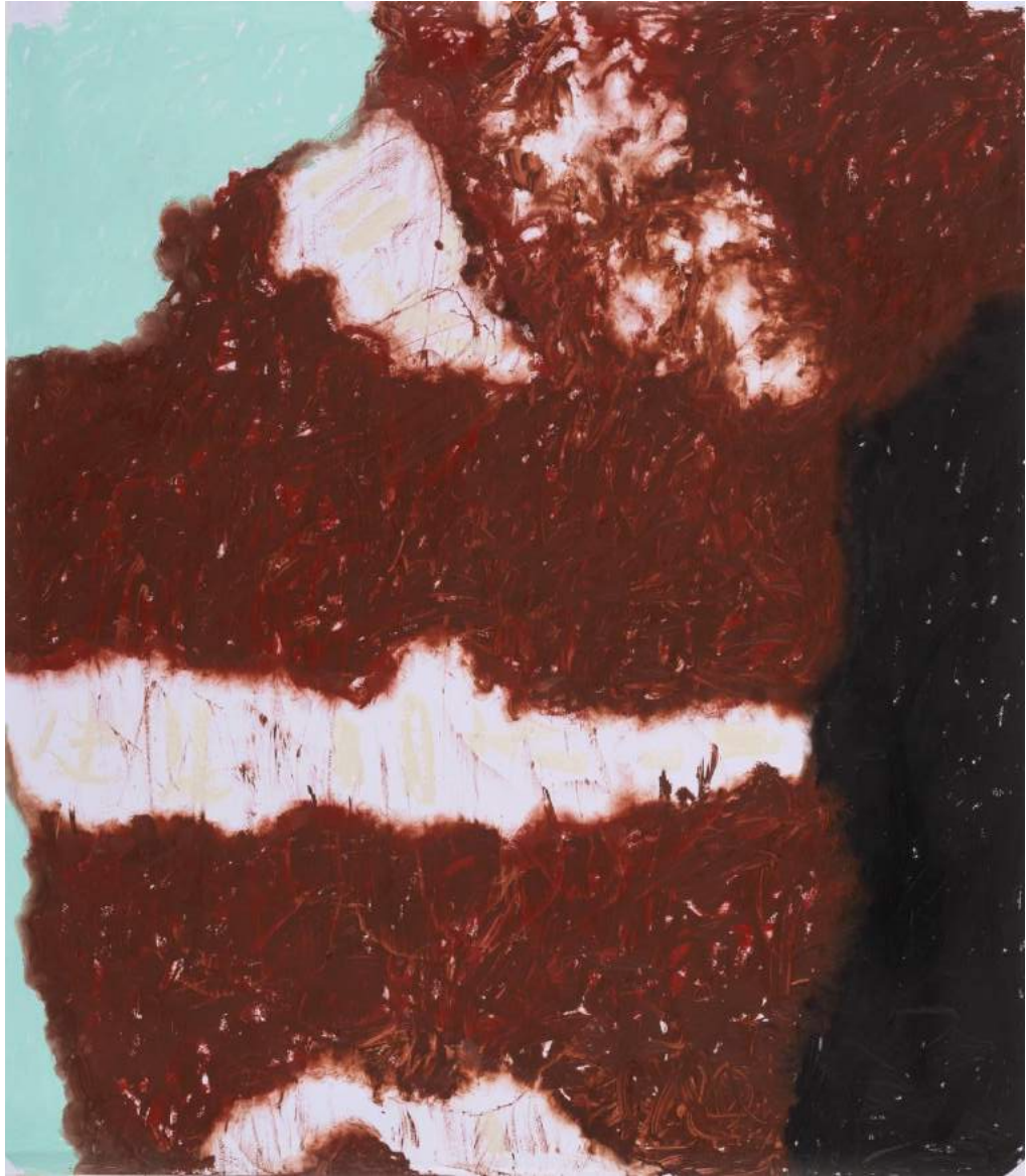
Untitled (Birthday Cake #3), 2023, oil stick on paper, 41 1/2 x 35 1/2 inches