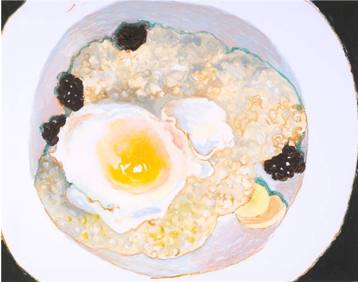
Untitled (Eggs, Blackberries) , 2020, oil stick on paper, 19 x 24 inches