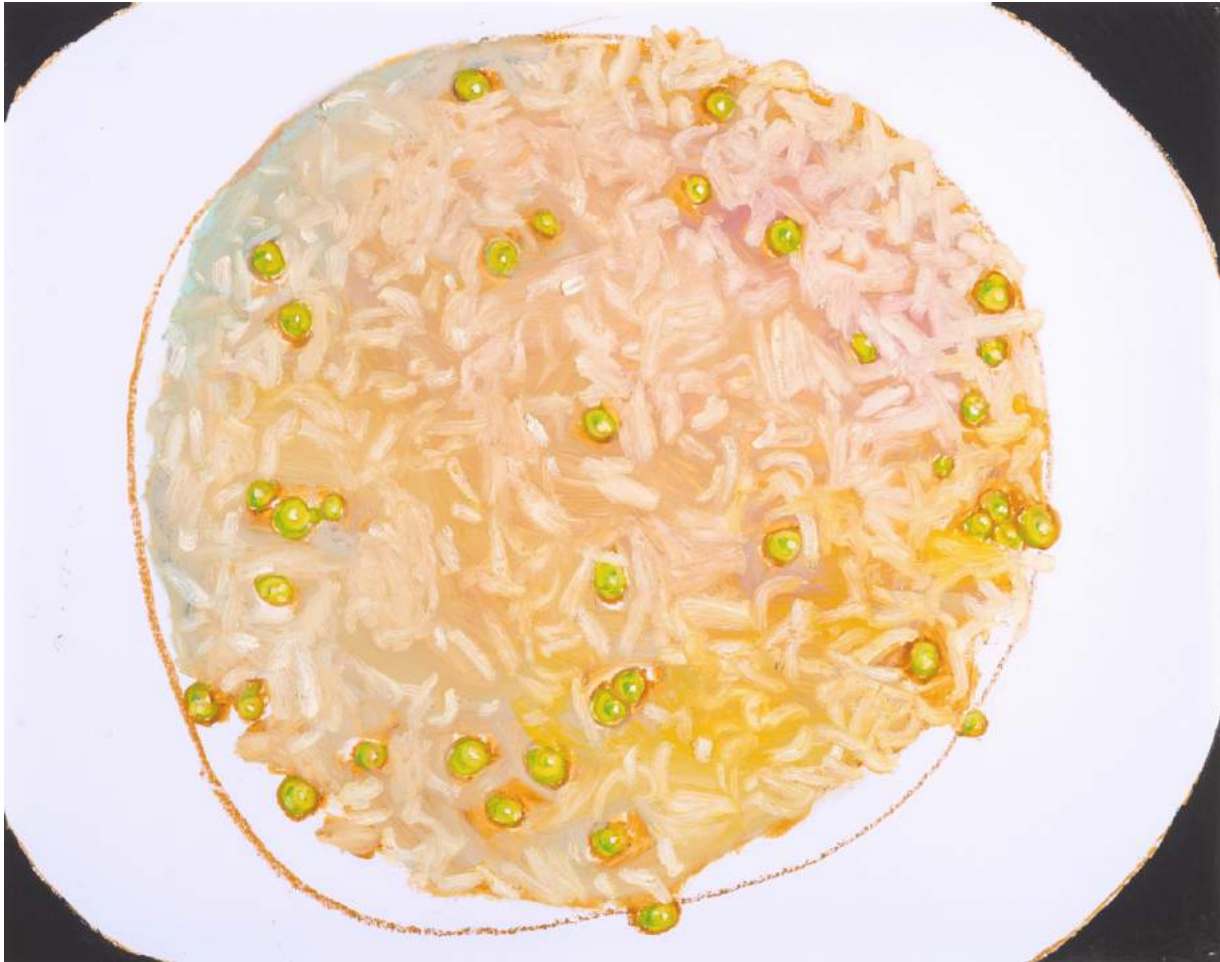
Untitled (Risotto, Peas), 2021, oil stick on paper, 19 x 24 inches