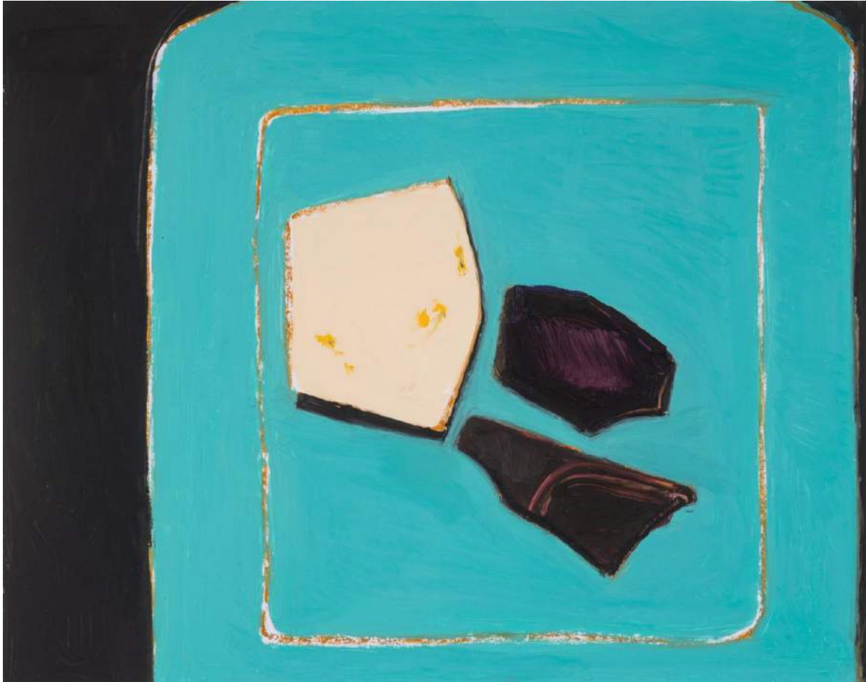
Untitled (Dark Chocolate), 2020, oil stick on paper, 24 x 19 inches