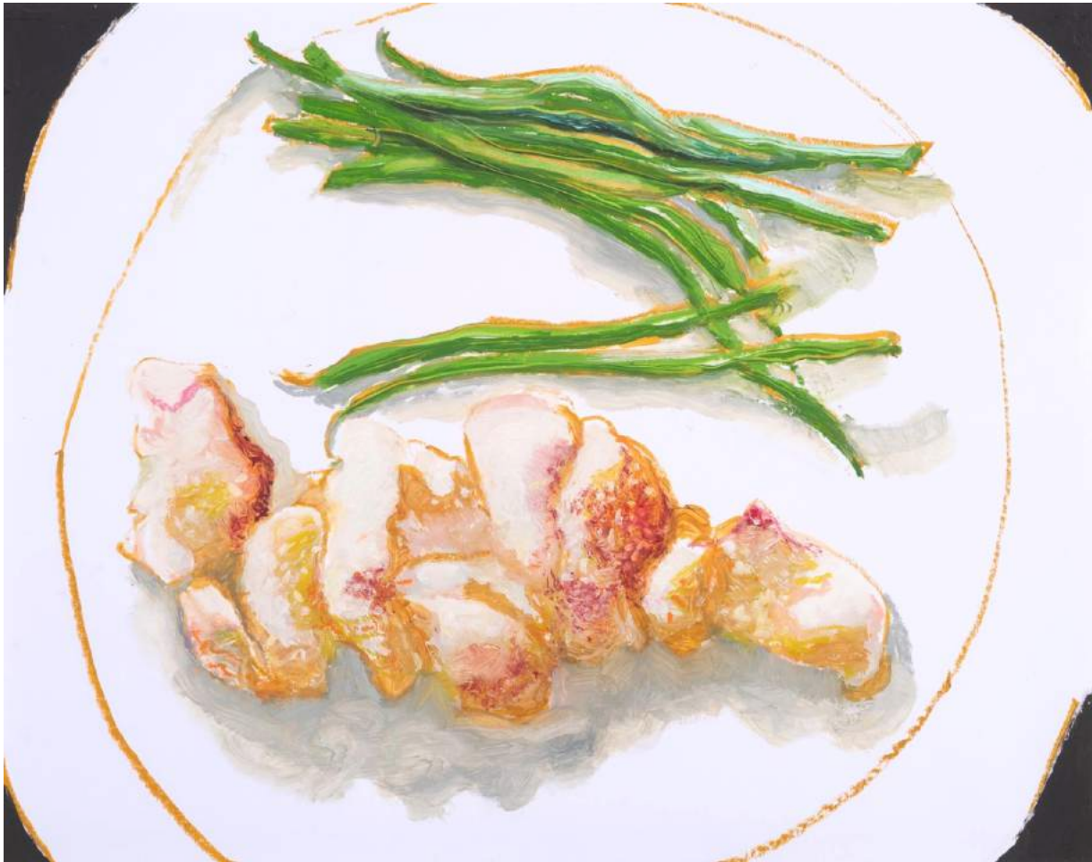
Untitled (Monk Fish, String Beans), 2023, oil stick on paper, 19 x 24 inches