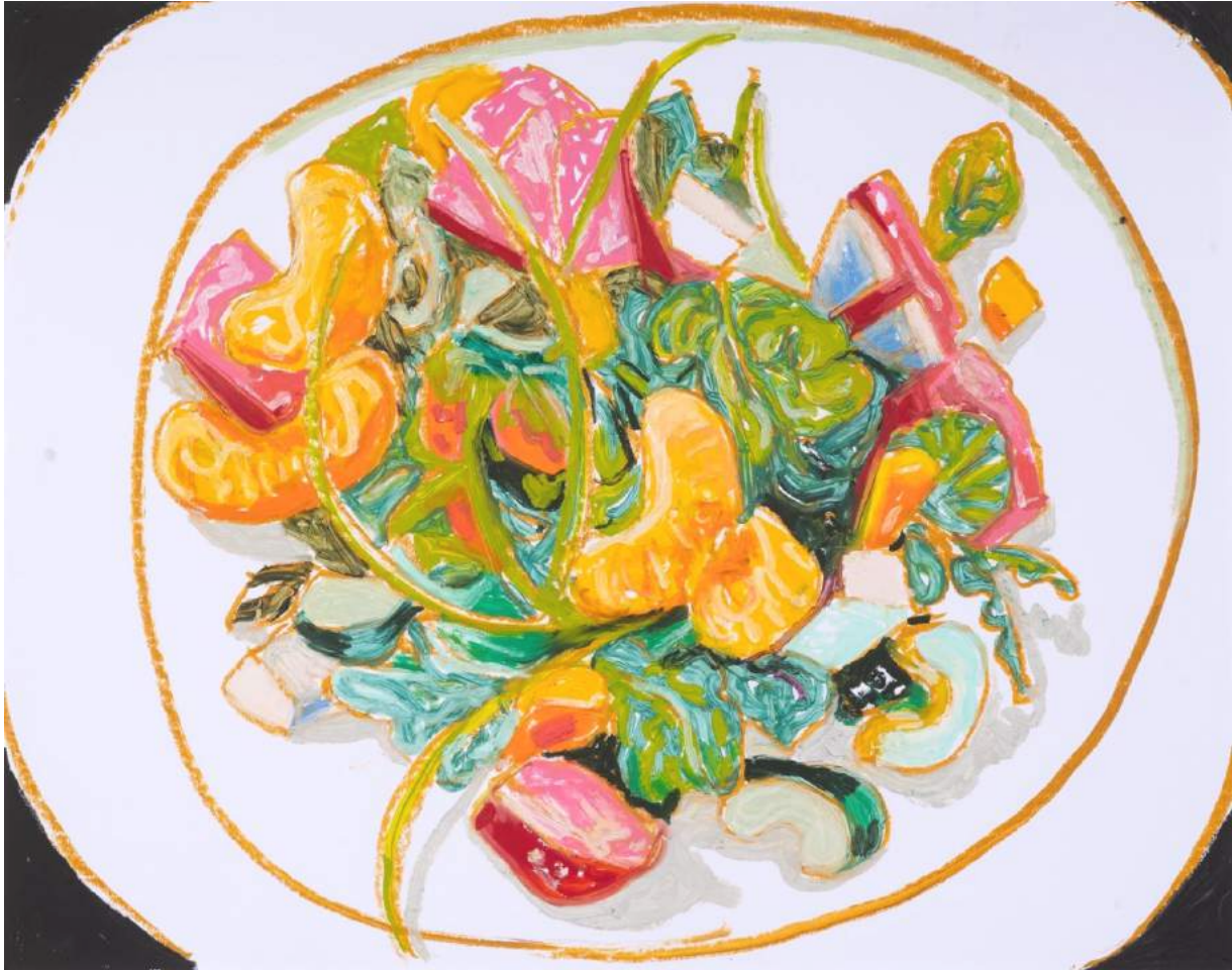
Untitled (Salad, Clementines, Mango), 2023, oil stick on paper, 19 x 24 inches