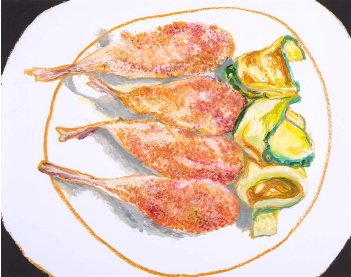
Untitled (Four Blowfish) , 2023, oil stick on paper, 19 x 24 inches