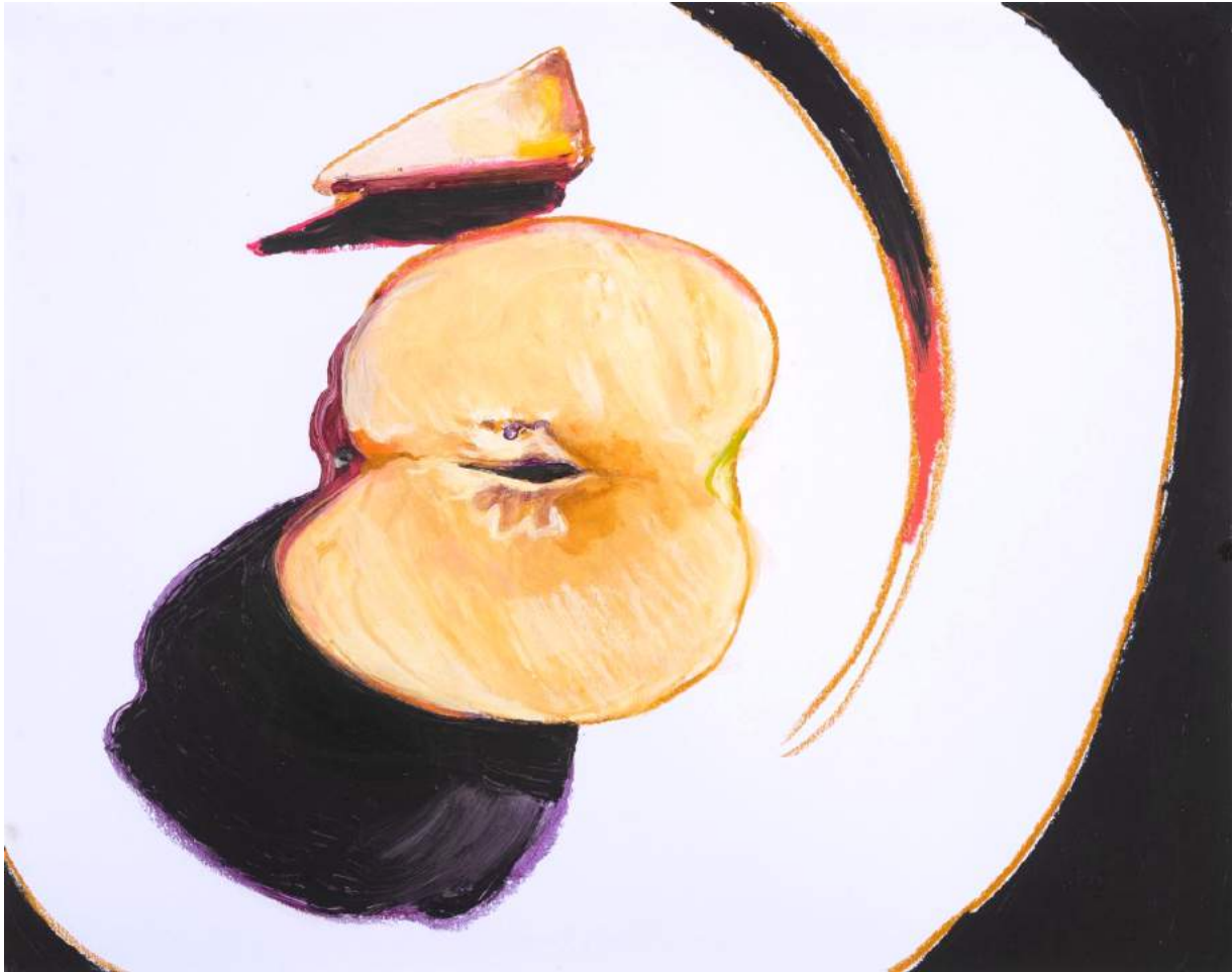
Untitled (Apple, Cheese #2), 2021, oil stick on paper, 24 x 19 inches