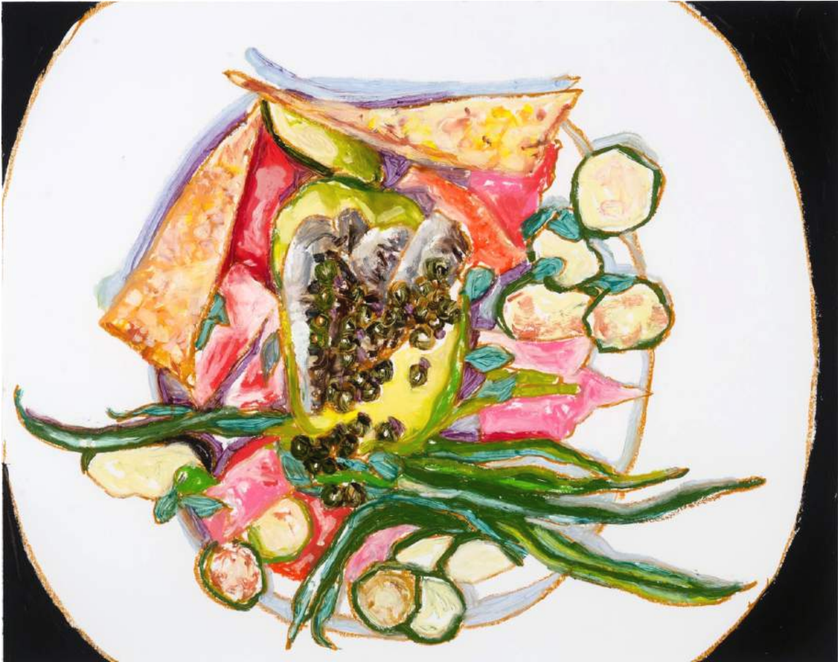
Untitled (String Beans, Nova, Zucchini), 2020, oil stick on paper, 19 x 24 inches