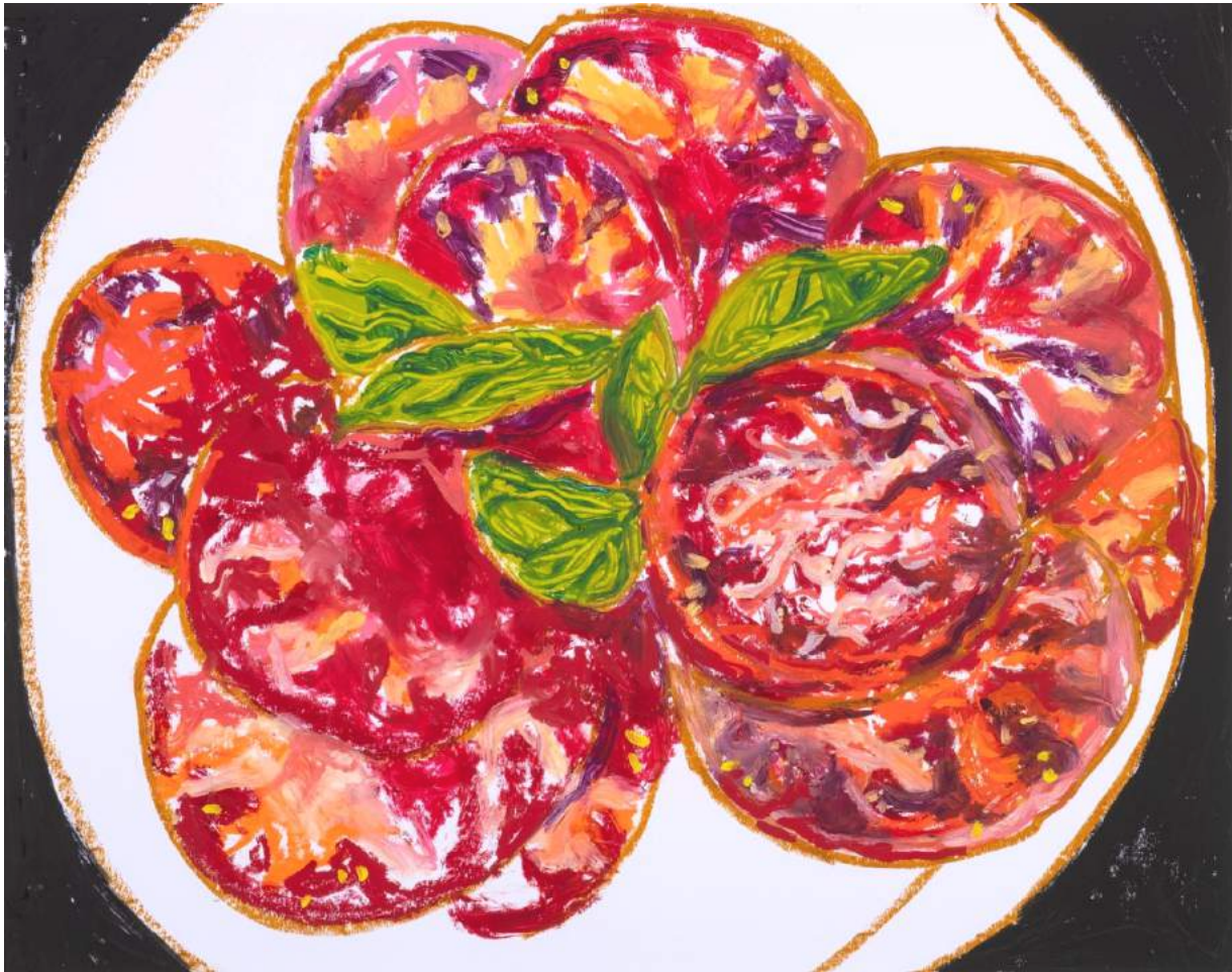
Untitled (Tomatoes, Basil), 2023, oil stick on paper, 19 x 24 inches