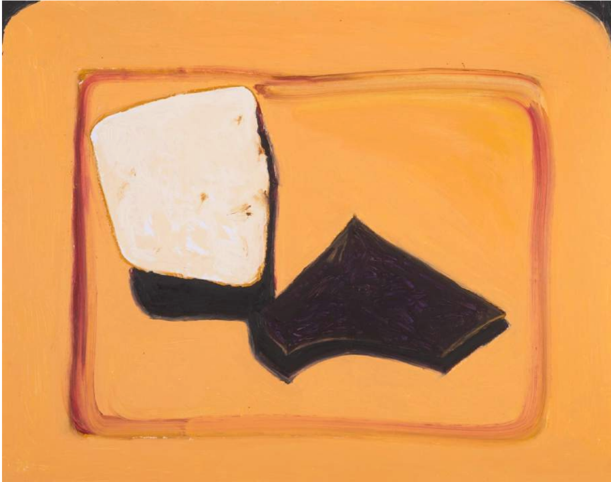
Untitled (White, Dark Chocolate, Orange Plate), 2020, oil stick on paper