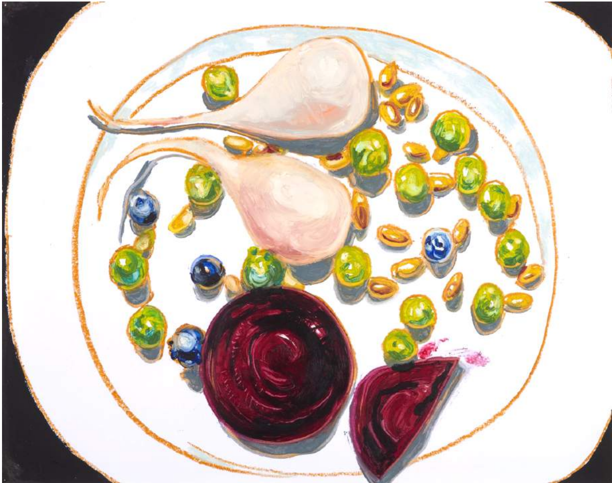
Untitled (Beets, Pears, Brussel Sprouts), 2021, oil stick on paper, 19 x 24 inches