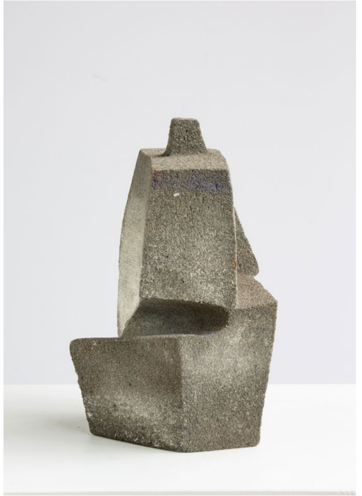
9. M58 , c. 1965, concrete, paint, 13 x 8 ¼ x 8 inches