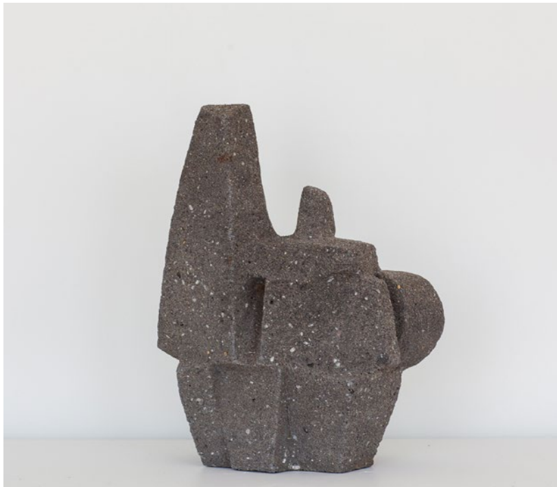
7. M57 , c. 1960, concrete, 14 ½ x 11 x 8 inches