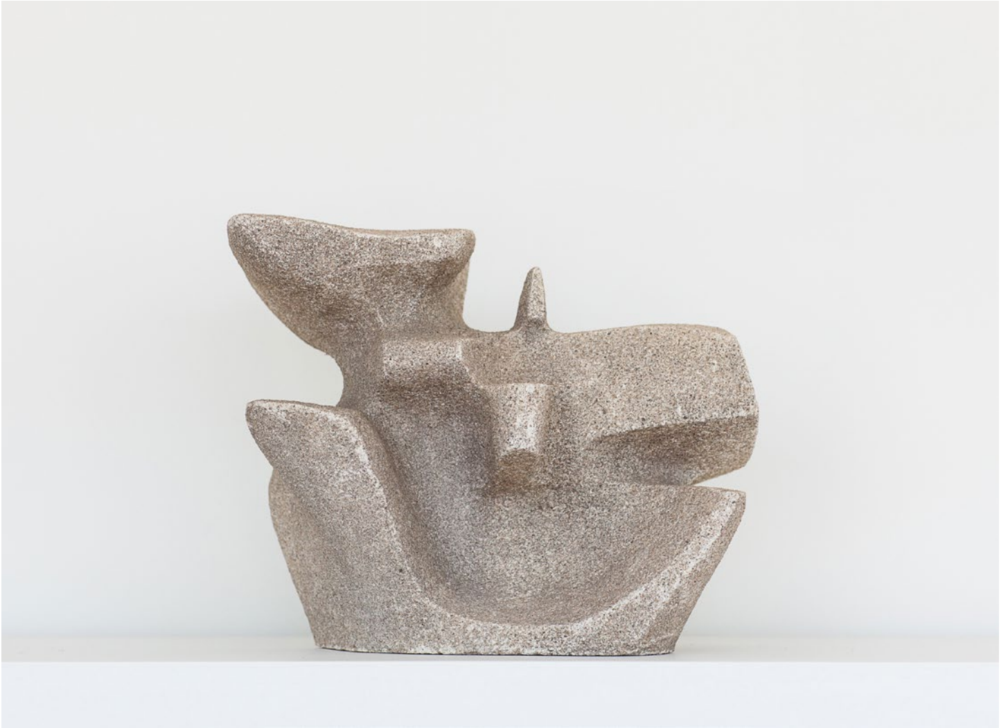
1. M33 , c. 1950s, concrete, 16 \frac{5}{8} x 14 \frac{3}{16} x 10 \frac{9}{16} inches