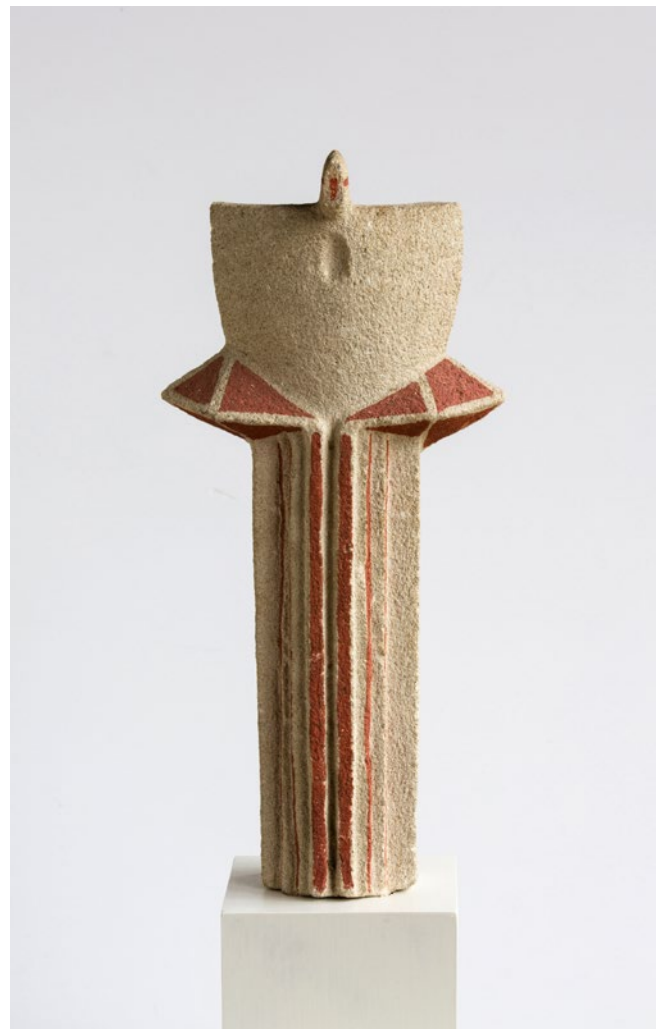
13. M.01 , 1969, concrete, paint, 19 x 9 ½ x 3 ¾ inches