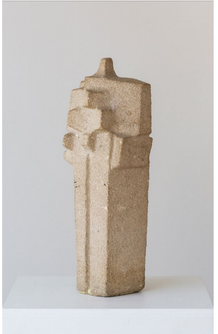
10. M.03 , 1965, concrete, 17 x 7 x 5 ½ inches