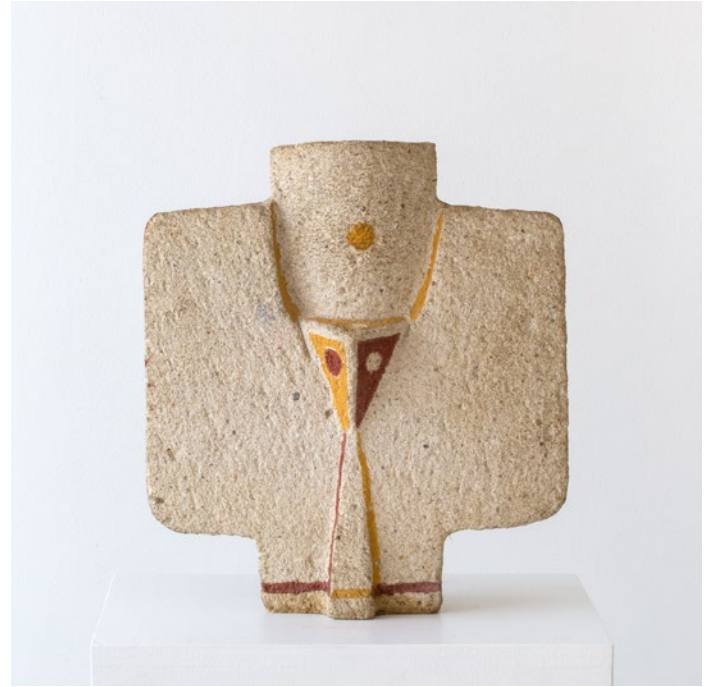
12. M.02 , 1965, concrete, paint, 13 \frac{3}{4} x 12 x 7