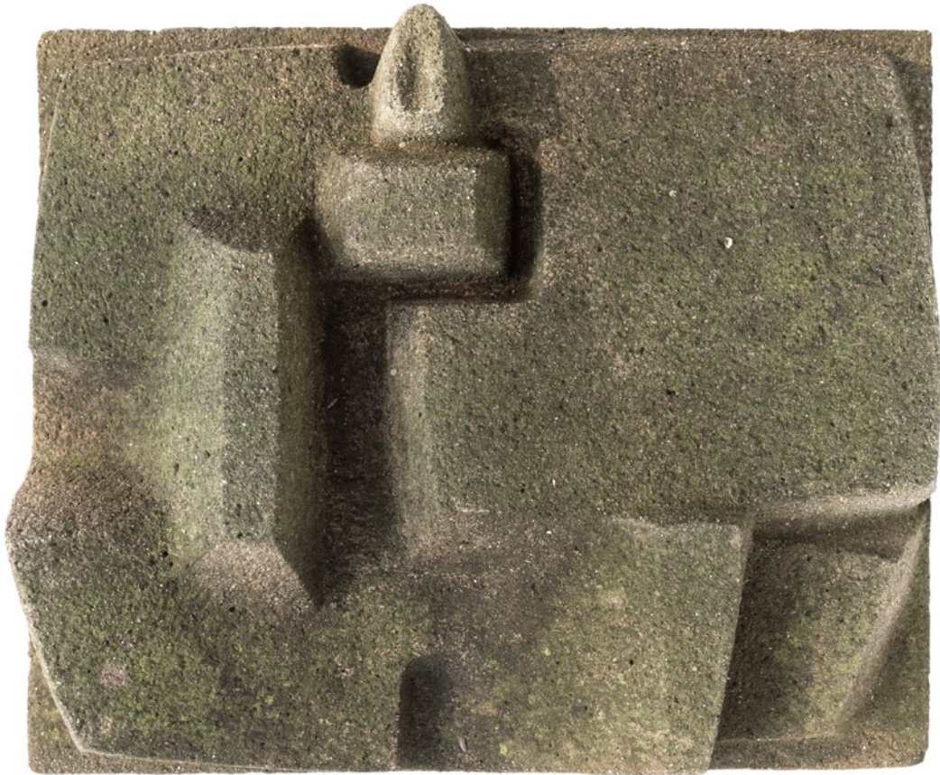
4. M48 , c. 1960-61, concrete, 19 3 / 4 x 24 1 / 2 x 4 3 / 4 inches