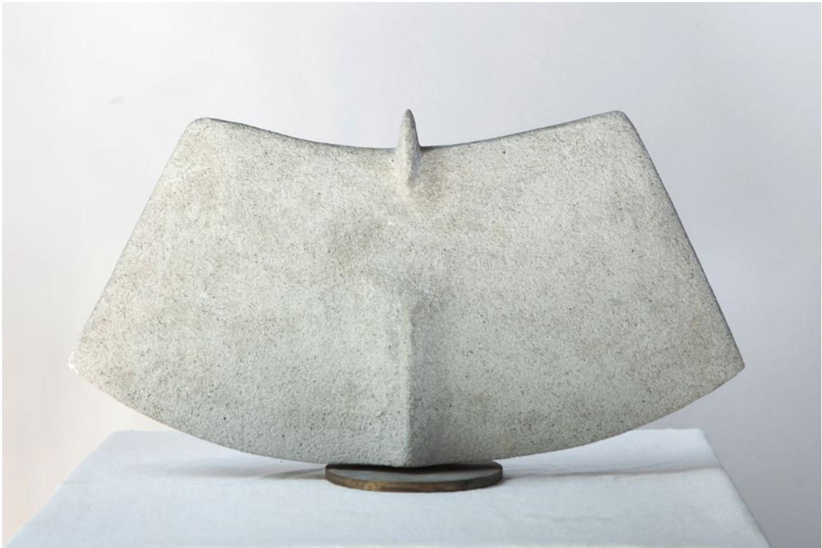
11. M14 , c. 1980-82, concrete, 13 x 24 \frac{1}{4} x 3 \frac{1}{2} inches