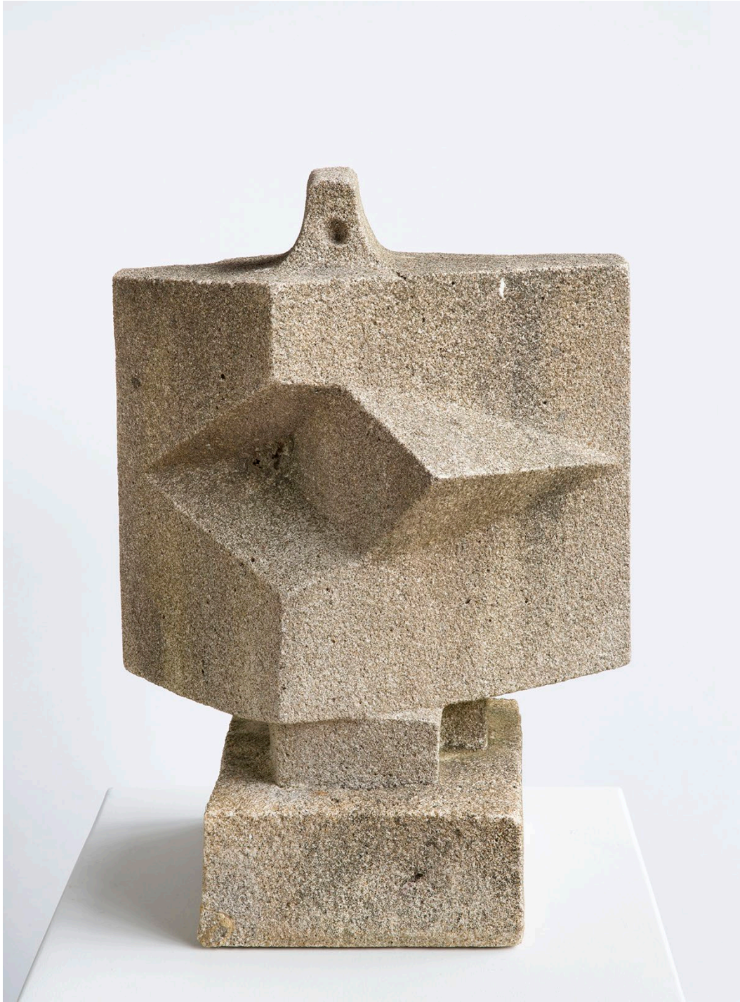
6. M42 , c. 1950s, concrete, 20 x 14 ¼ x 10 inches