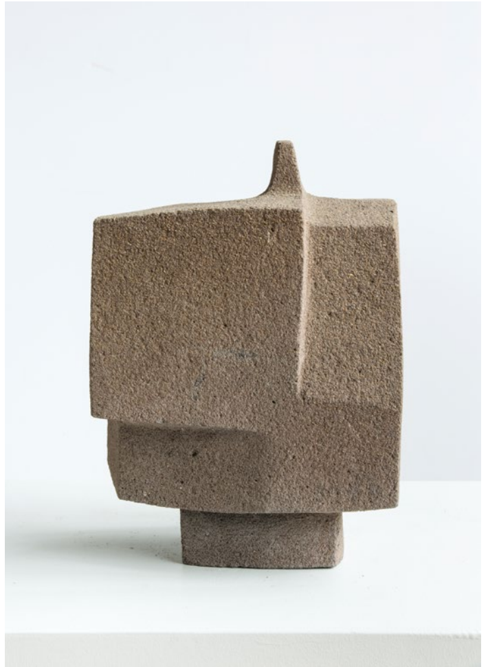
8. M36 , c. 1960-63, concrete, 12 x 9 ½ x 8 inches