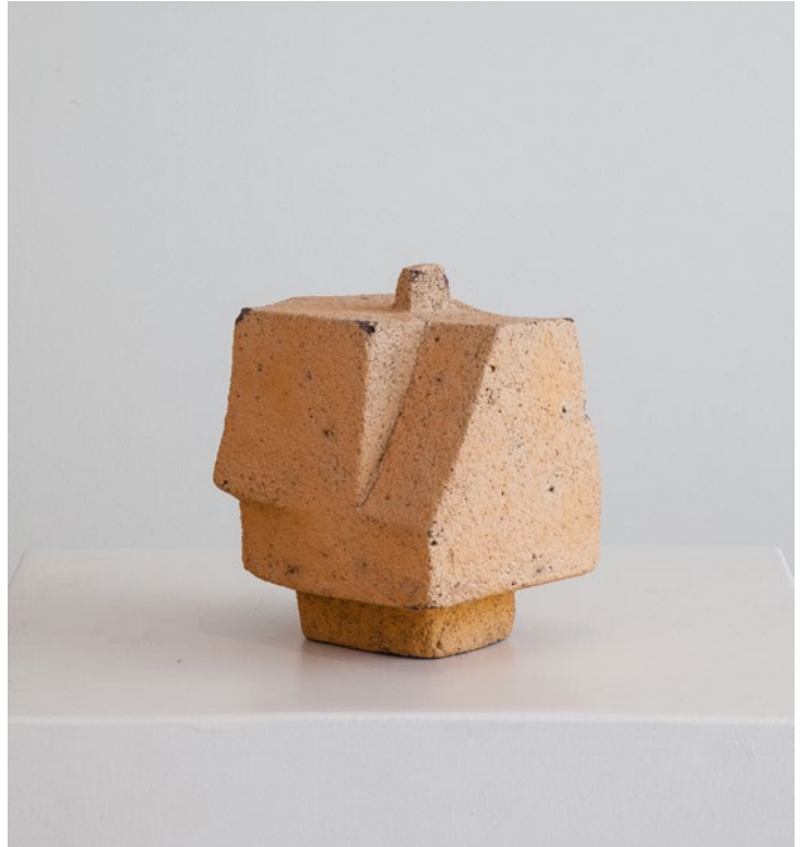
5. M37 , c. 1960-63, concrete with orange paint, 7 1/2 x 6 1/2 x 5 3/4 inches