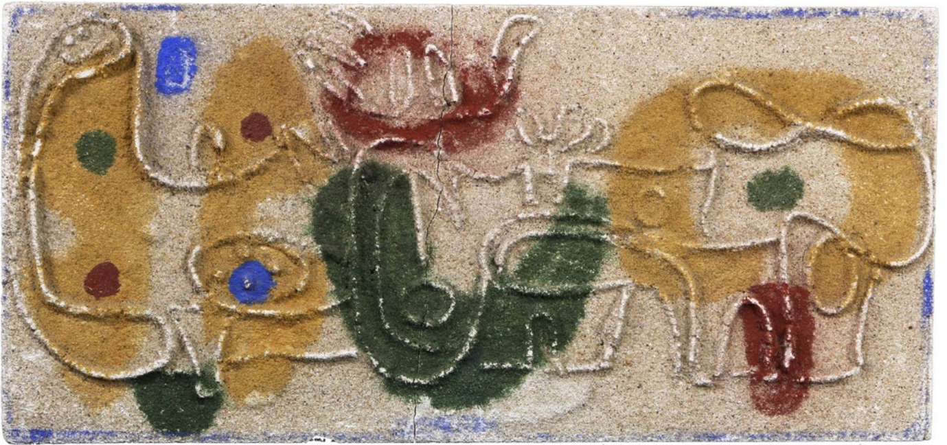
14. A.02, c. 1950s, sand cast plaster polychrome relief, 9 \frac{3}{4} x 21 \frac{1}{4} x \frac{3}{4} inches