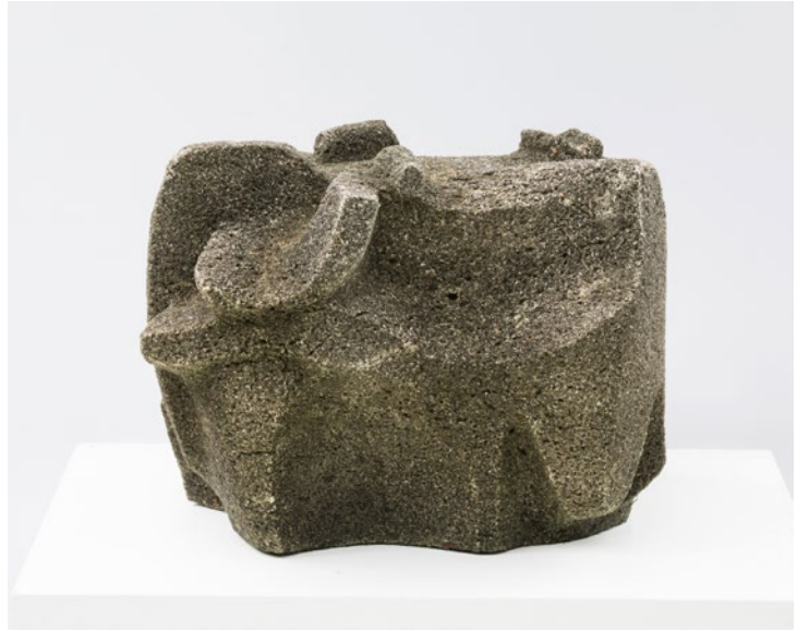
2. M54 , c. 1958, concrete, 10 \frac{3}{4} x 13 \frac{1}{4} x 12 \frac{1}{4} inches