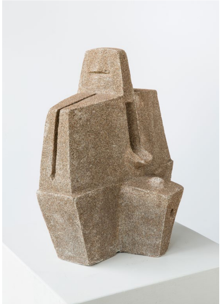
3. M41 , c. 1950s, concrete, 16 ½ x 15 x 11 inches