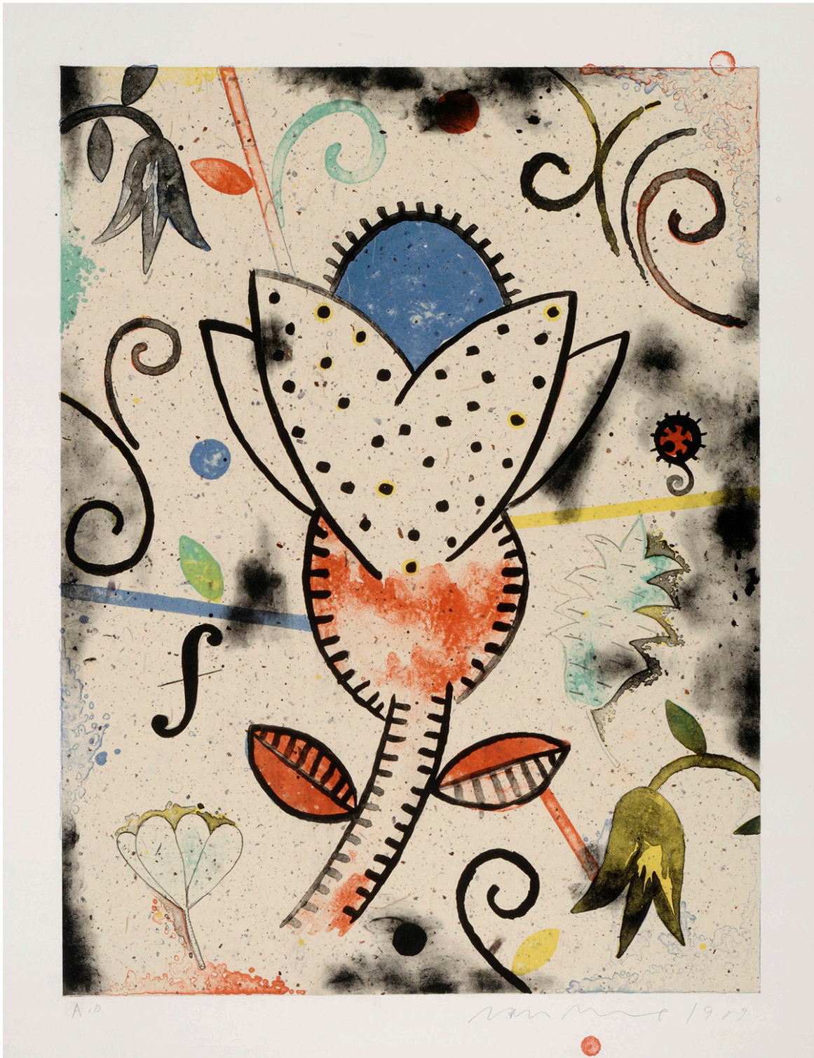
1. Lotus , 1989, lithograph, chine collé, 37 x 29 inches, AP