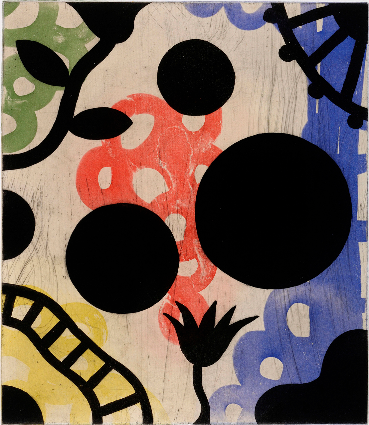
15. Agua Fria , 1995, color aquatint, chine collé, 26 x 19 3 / 4 inches, Edition of 50