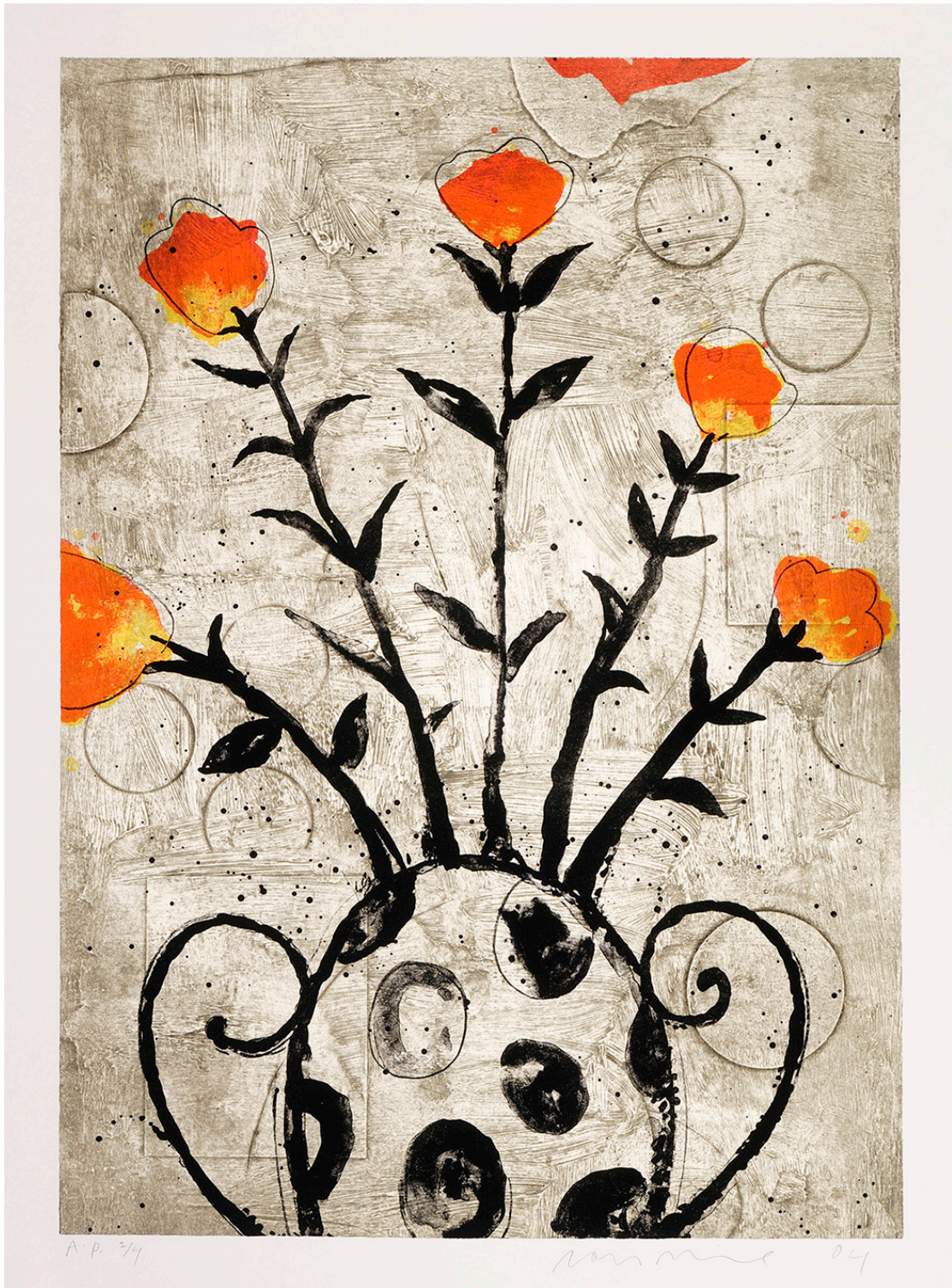
18. Nature Morte , 2004, lithograph, collagraph, 43 5/8 x 33 1/4 inches, Edition of 40