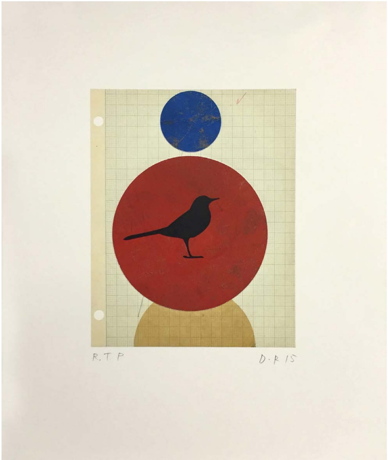
8. Little Tantric Bird , 2015, relief, collage, chine collé, digital print, 19 ¼ x 16 ¼ inches, Edition of 30