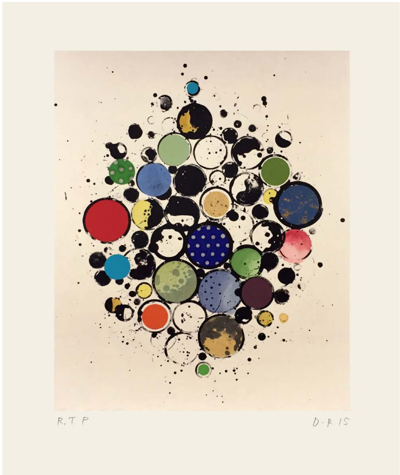
6. 24 Gems for John Torreano , 2015, lithograph, relief print, collage, hand painting, chine collé, 29 ¼ x 24 3/8 inches, Edition of 30