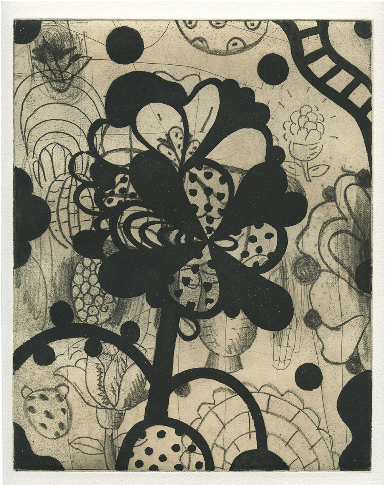
3. Poison , 1995, chine collé , soft ground etching, sugar lift aquatint, 19 ¾ x 15 ¾ inches, Edition of 20