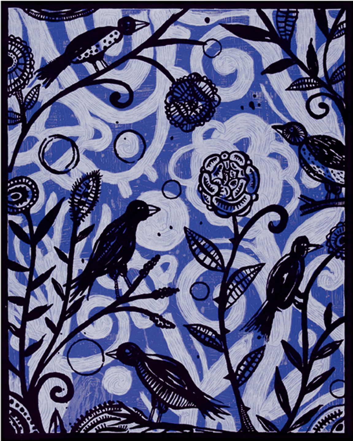
13. Blackberry Thieves III , 2008, color woodcut, chine collé, 43 \frac{3}{4} x 36 \frac{1}{2} inches, Edition of 15