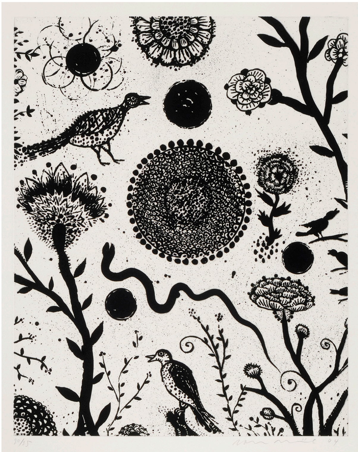
12. William Morris, 2004, etching, 29 5/8 x 25 1/2 inches, Edition of 25