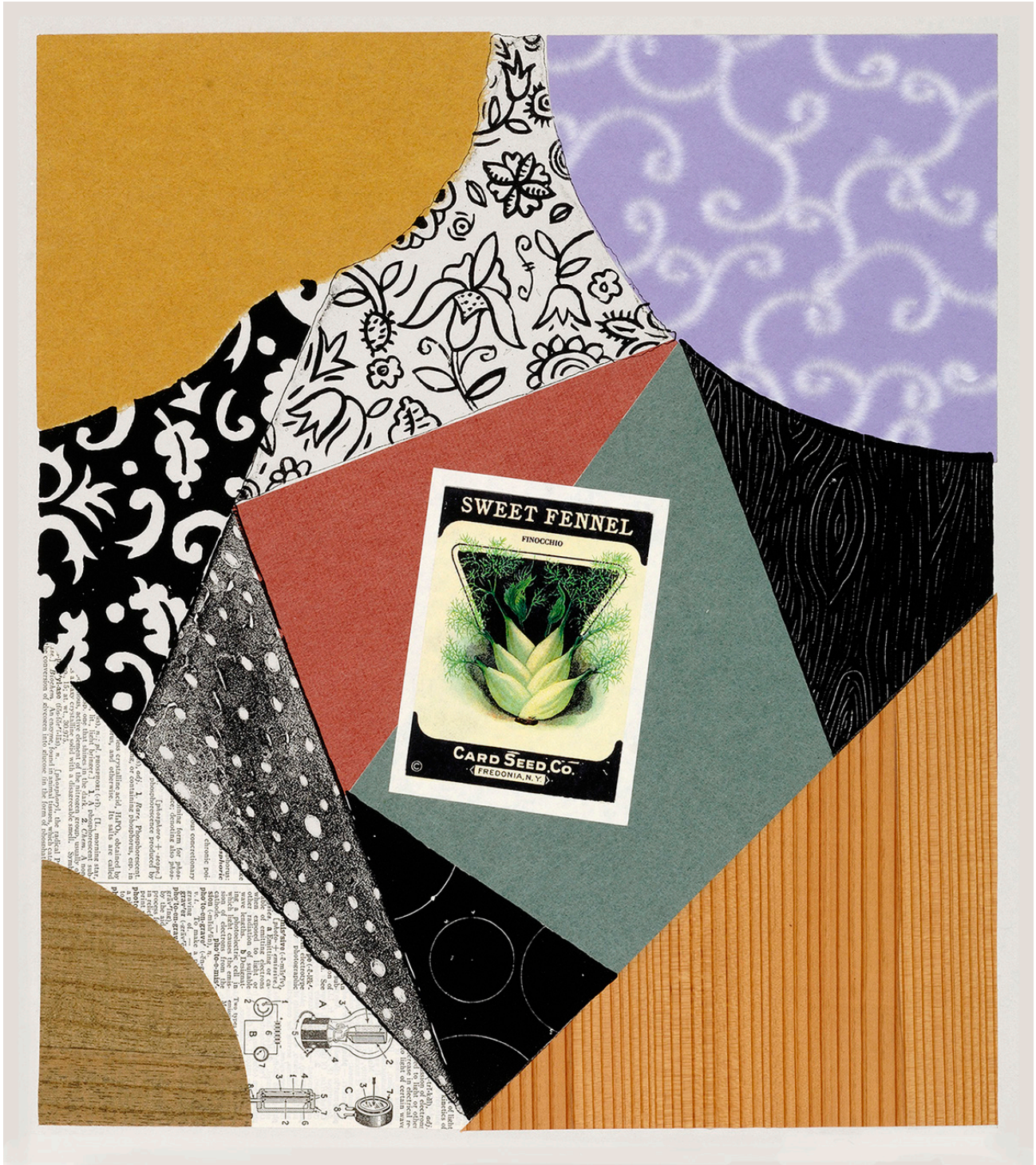
20. Finocchio , 1994, lithograph, 20 ½ x 18 inches, Edition of 18