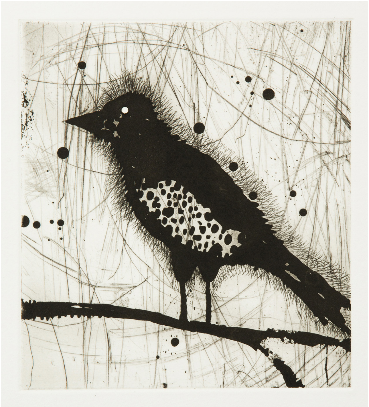
9. Harried Little Bird , 2005, etching, drypoint, aquatint, 13 3 / 4 x 12 inches, Edition of 14