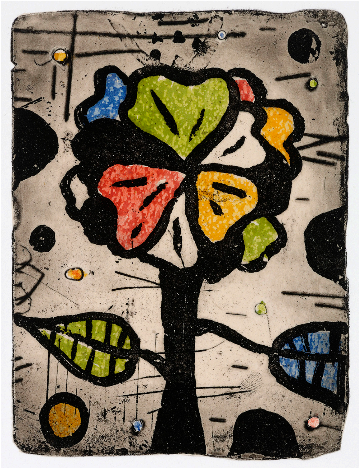
2. Piccolo Fiore , 1993/2007, hand colored etching, 15 x 11 inches, Edition of 46