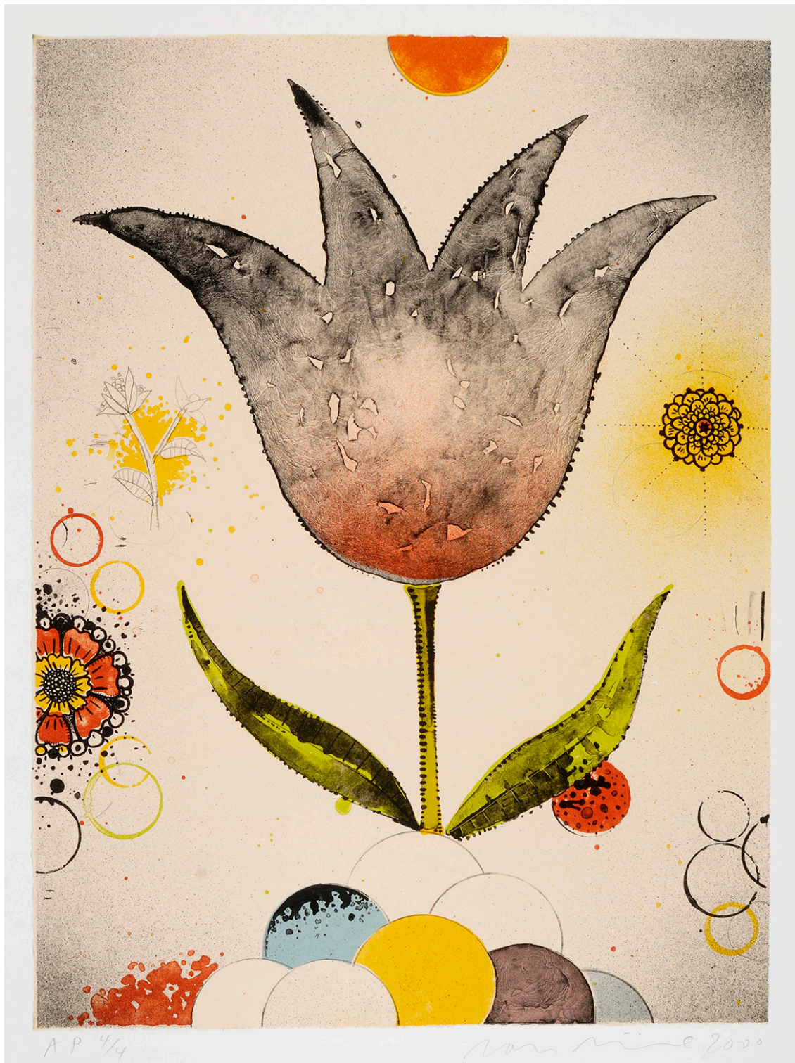
17. Tulipa , 2000, lithograph, chine collé, 37 x 26 inches, Edition of 40