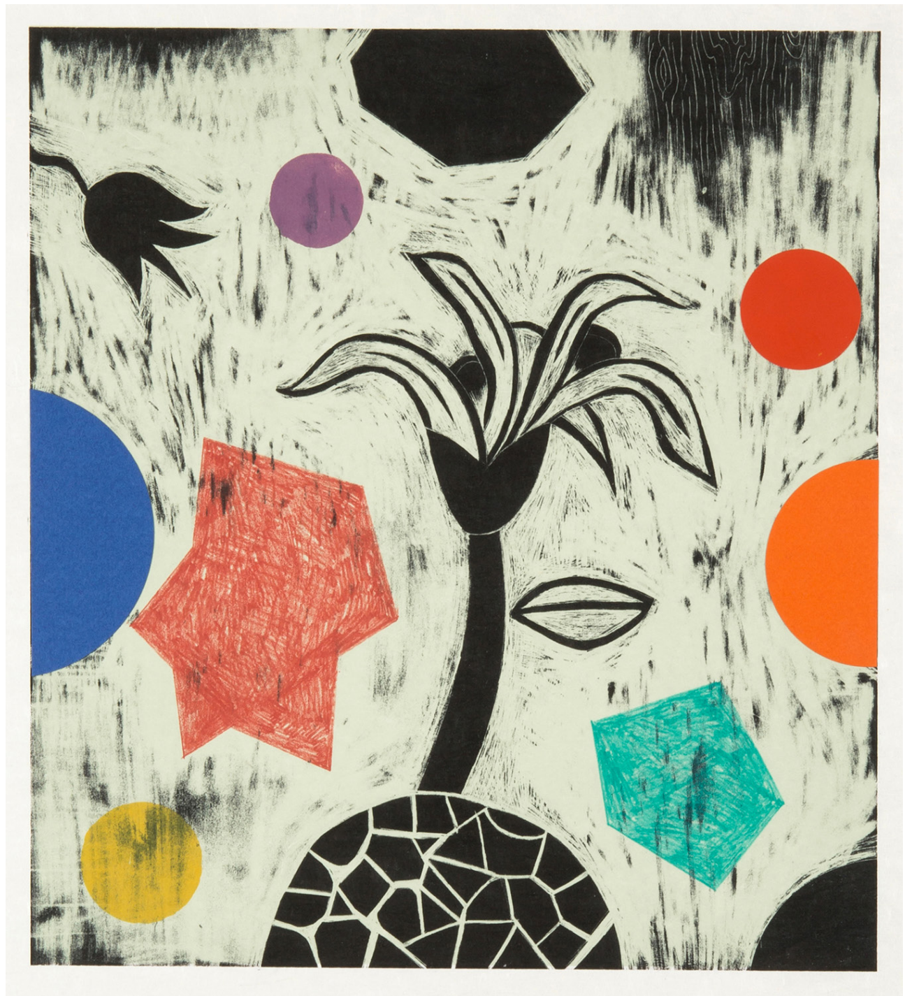
16. Casa Monte , 2014, lithograph, collage, 24 3 / 4 x 20 1 / 8 inches, Unique