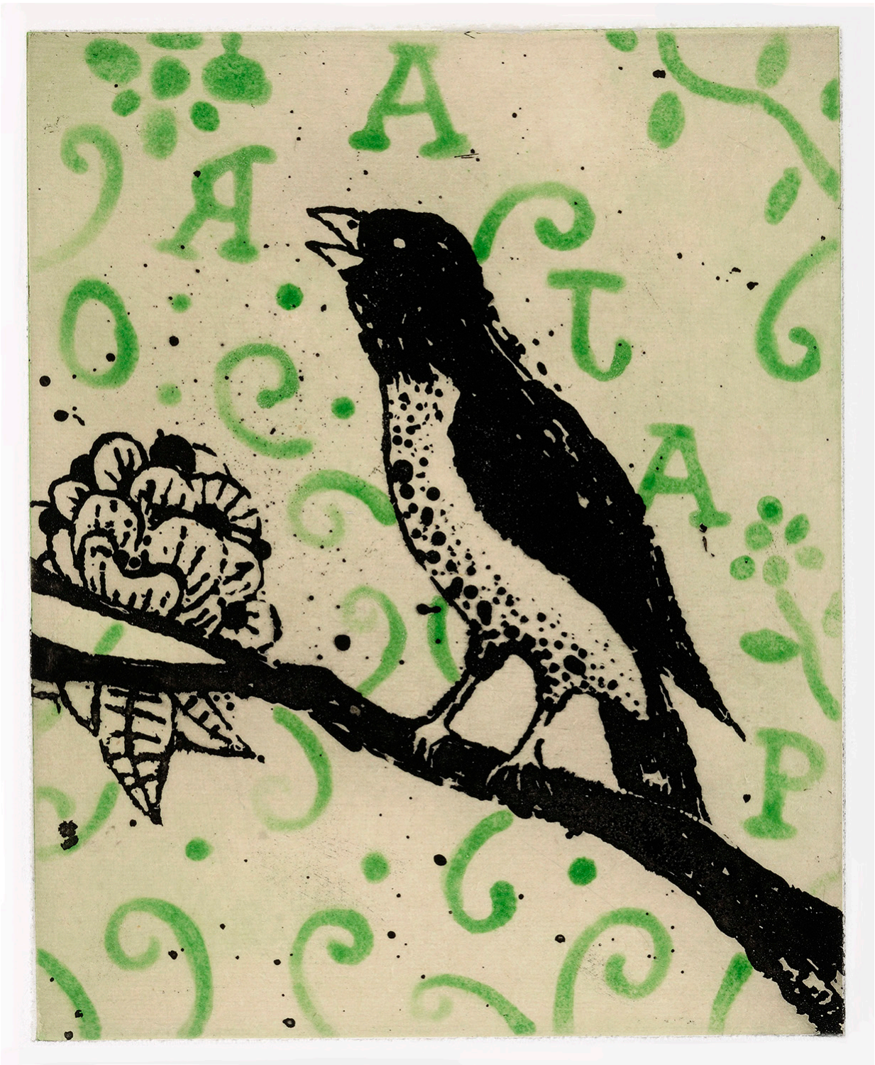
11. Bird on a Limb , 2003, aquatint, spitbite, chine collé, 20 x 15 inches, Edition of 75