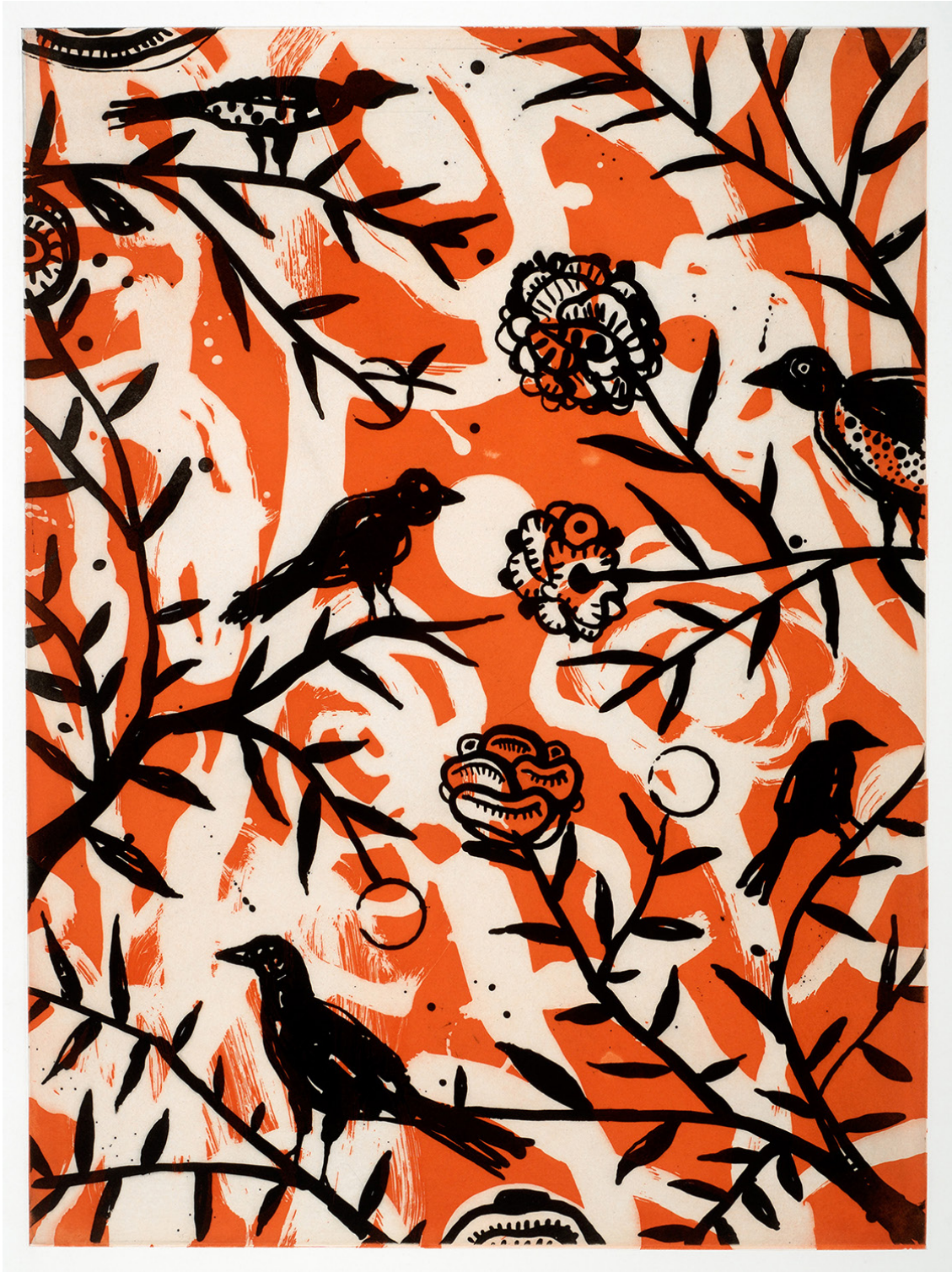
10. Starlings (Orange) , 2004, color aquatint, 29 ½ x 22 ¾ inches, Unique