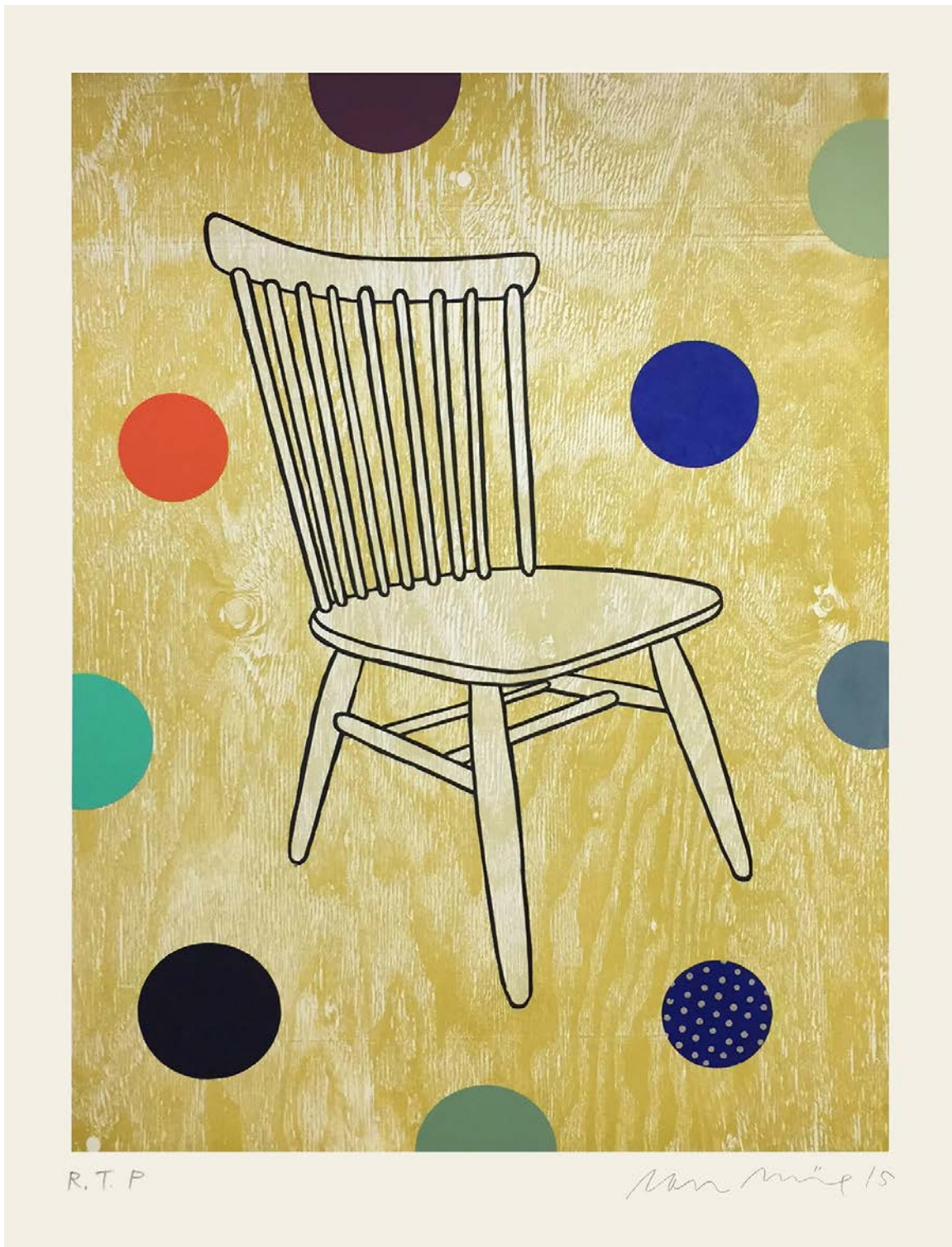
19. Empty Chair , 2015, woodcut, relief print, collage, chine collé, 42 ½ x 32 ½ inches, Edition of 24