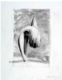
Venus, Deep Field 2, 2009 graphite on Dura-Lar 24 x 19 inches signed and dated lower right: Bryan Hunt/7.09