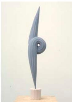
Small Standing Spiral, 2009 cast Aqua-resin with grey enamel 28 x 6 x 4 inches cast Aqua-resin base: 3 1/2 x 4 x 4 inches edition 1 of 6