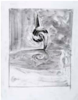
Venus with Reflection 3, 2009 graphite on Dura-Lar 24 x 19 inches 28 x 23 inches framed signed and dated lower right: Bryan Hunt/7.09