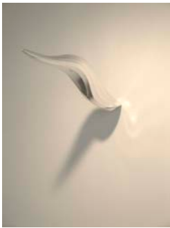
Study for Fusiform, 2009 cast Aqua-resin with metal leaf 5 1/2 x 2 1/2 x 19 inches edition of 6