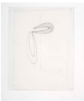
Magnetic Fields and Solar Flares 3 , 2009 graphite on Dura-Lar 14 x 11 inches signed and dated lower right: Bryan Hunt 6.09