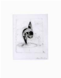
Reflective Venus 1, 2009 graphite on Dura-Lar 14 x 11 inches signed and dated lower right: Bryan Hunt 6.09