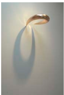
Small Copper U, 2, 2009 cast Aqua-resin with copper leaf 4 1/2 x 11 1/4 x 13 3/4 inches edition 1 of 4