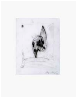
Reflective Venus 2, 2009 graphite on Dura-Lar 14 x 11 inches signed and dated lower right: Bryan Hunt/6.09