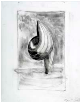
Venus, Deep Field 3, 2009 graphite on Dura-Lar 24 x 19 inches signed and dated lower right: Bryan Hunt/7.09