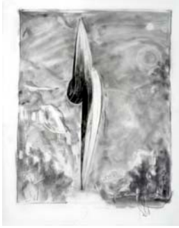
Standing Spiral, Deep Field 3, 2009 graphite on Dura-Lar 24 x 19 inches signed and dated lower left: Bryan Hunt/7.09