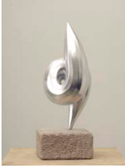
Small Venus, 2009 cast Aqua-resin with metal leaf 13 x 6 x 6 inches limestone base: 3 x 6 x 6 inches edition 1 of 6