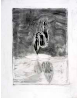
Venus with Reflection 2, 2009 graphite on Dura-Lar 24 x 19 inches 28 x 23 inches framed signed and dated lower right: Bryan Hunt/6.09