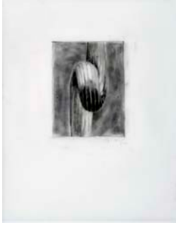
Standing Spiral Detail , 2009 graphite on Dura-Lar 24 x 19 inches signed and dated lower right: Bryan Hunt/6.09