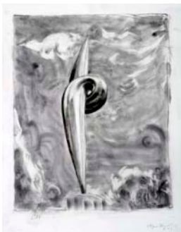
Standing Spiral, Deep Field 2, 2009 graphite on Dura-Lar 24 x 19 inches signed and dated lower right: Bryan Hunt/7.09