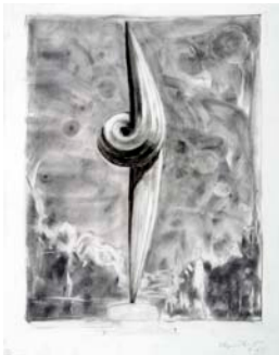
Standing Spiral, Deep Field 1, 2009 graphite on Dura-Lar 24 x 19 inches signed and dated lower right: Bryan Hunt/7.09