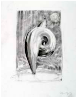
Venus, Deep Field 1, 2009 graphite on Dura-Lar 24 x 19 inches signed and dated lower right: Bryan Hunt/7.09 titled lower left and right: Venus/Deep Field #1