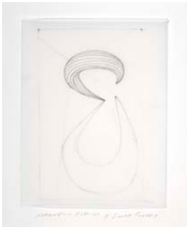
Magnetic Fields and Solar Flares 2 , 2009 graphite on Dura-Lar 14 x 11 inches signed and dated lower right: Bryan Hunt/6.09