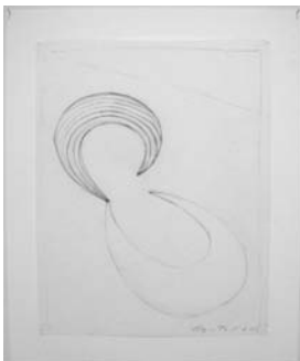
Magnetic Fields and Solar Flares 1 , 2009 graphite on Dura-Lar 14 x 11 inches signed and dated lower right: Bryan Hunt 6.09