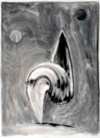
V<nus, Deep Field, 2009 graphite on Dura-Lar 36 x 48 inches signed and dated lower right Bryan Hunt/4.09