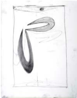
U-ship with Shadows 2, 2009 graphite on Dura-Lar 24 x 19 inches signed lower right: Bryan Hunt