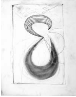
U-ship with Shadows 3, 2009 graphite on Dura-Lar 24 x 19 inches signed and dated lower right: Bryan Hunt/6.09