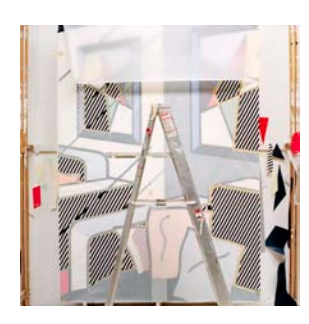
Ladder, 1992 archival pigment print 24 x 24 inches (sheet) 24 7/8 x 25 1/8 inches (framed) edition of 12

Photographs are available in two sizes: 24 \times 24 inches (ed. 12) and 44 \times 44 inches (ed. 6). These images were shot with a Hasselblad camera from 1990 to 1992 and printed in 2008 as archival pigment prints from digital scans of the original negatives.