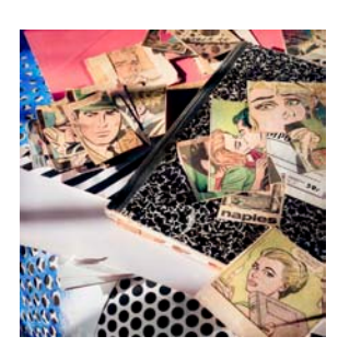
Naples, 1990 archival pigment print 24 x 24 inches (sheet) 24 7/8 x 25 1/8 inches (framed) edition of 12