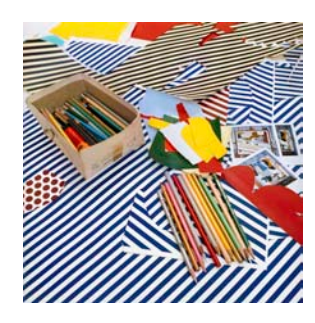
Pencils, 1990 archival pigment print 44 x 44 inches (sheet) 45 1/8 x 45 1/8 inches (framed) edition of 6