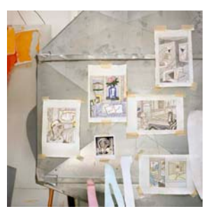
Drawings, Heating Duct, 1992 archival pigment print 24 x 24 inches (sheet) 24 7/8 x 25 1/8 inches (framed) edition of 12