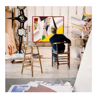
Roy with Reflections on the Prom, 1990 archival pigment print 24 x 24 inches (sheet) 24 7/8 x 25 1/8 inches (framed) edition of 12