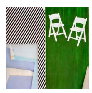
2 Chairs, 1991 archival pigment print 24 x 24 inches (sheet) 24 7/8 x 25 1/8 inches (framed) edition of 12