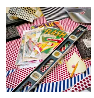
Flash with Level, 1990 archival pigment print 24 x 24 inches (sheet) 24 7/8 x 25 1/8 inches (framed) edition of 12