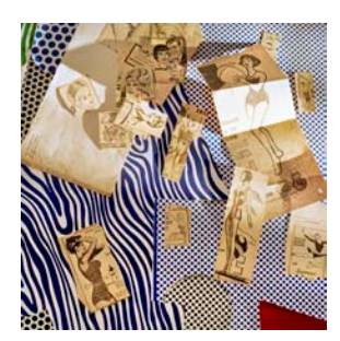
Bathing Beauties, Blue, 1990 archival pigment print 24 x 24 inches (sheet) 24 7/8 x 25 1/8 inches (framed) edition of 12