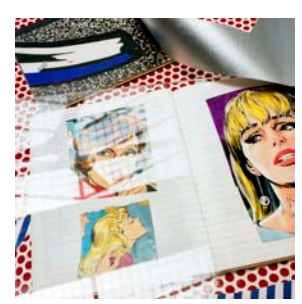
Crying Girls, Reflections, 1990 archival pigment print 24 x 24 inches (sheet) 24 7/8 x 25 1/8 inches (framed) edition of 12