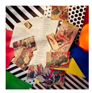
Explosions, Slam, 1991 archival pigment print 24 x 24 inches (sheet) 24 7/8 x 25 1/8 inches (framed) edition of 12