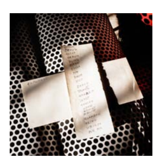
Explosions, List (red), 1990 archival pigment print 24 x 24 inches (sheet) 24 7/8 x 25 1/8 inches (framed) edition of 12