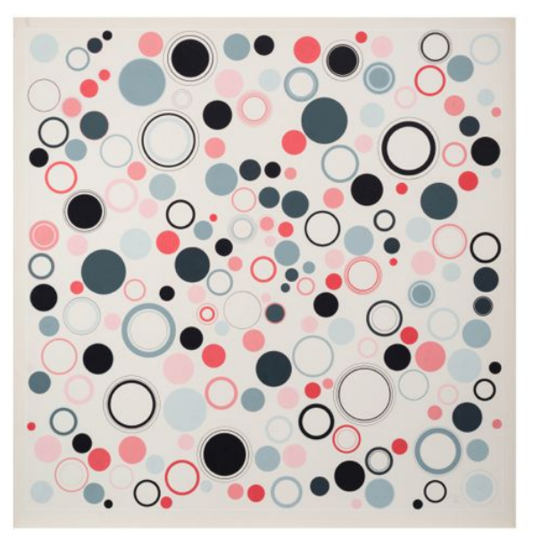
Geometría libre (4508), 1967, gouache on paper, 30 5/16 x 29 7/8 in

The Drawing Room is pleased to present two exhibitions on view June 27 through July 28, ANTONIO ASIS and JENNIFER BARTLETT Selected Work 1970-2003. A separate press release is available for the Jennifer Bartlett exhibition.