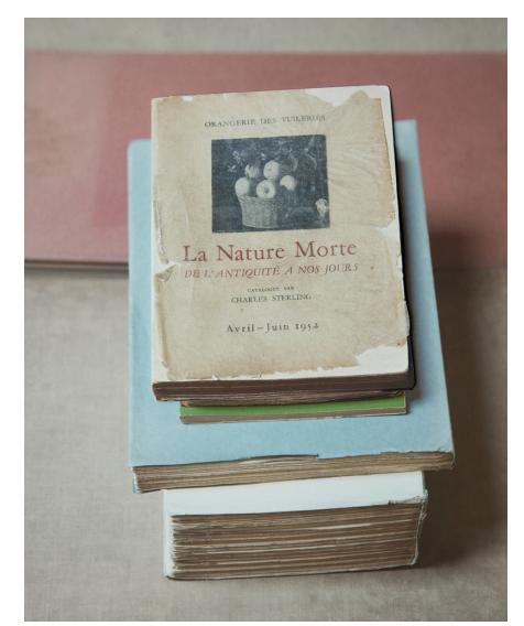
La Nature Morte, 2022, 18 3/4 x 15 inches

The Drawing Room is pleased to present Mary Ellen Bartley: New Photographs, on view from May 20 through June 20, 2022. The exhibition features photographs from four series: Blue Books, Reading November, Split Stacks and Morandi's Books .