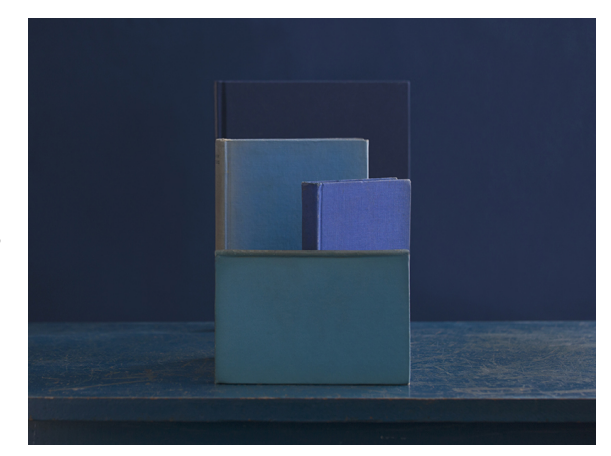
Blue Books #13, 2021, 15 x 20 inches

In the series Blue Books , clothbound texts are wrapped in dense hues of blue. Their covers are variously pristine, stained or frayed, revealing storied histories. Bartley has a profound understanding of depth of field, and here the illusion of cut and collaged pictorial planes is achieved by the precise alignment of the books captured in the camera's lens. The assembled books recede and move forward with startling tangibility. With natural light, she harnesses deep space to such a degree that each book resonates within the assemblage as tonal shifts propel the objects through an inky twilight.