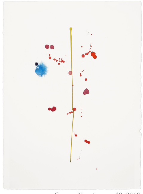
Composition, January 10, 2018