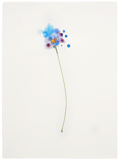
Composition, September 5, 2017

Opening May 11th and on view through June 11th, The Drawing Room in East Hampton is pleased to present GUSTAVO BONEVARDI New Watercolors. A separate press release is available for the concurrent exhibition, JOHN TORREANO Gold Gems Balls. Trained as an architect and living in East Hampton and New York City, Bonevardi's creates sculpture and drawing projects that have been widely exhibited and commissioned. In this first presentation focused solely on his exuberant abstract watercolors that evoke blossoms and constellations, Bonevardi balances a process driven by chance with a meticulously choreographed technique.