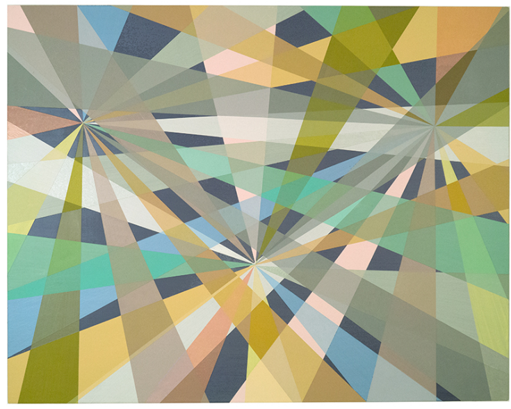
Arranging the Aftermath, 2016, oil and acrylic on linen, 30 x 38 in