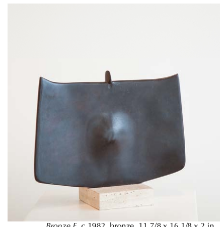
Bronze E, c.1982, bronze, 11 7/8 x 16 1/8 x 2 in.

"The lyrical imagination and technical excellence of Nivola's work had never been a secret....we are privileged to enter the singular world of Costantino Nivola."