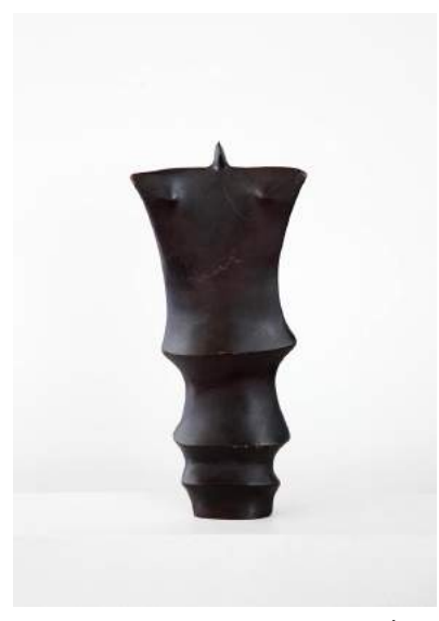
P68, 1982, 7 3/4 x 3 3/8 x 1 inches

Opening on August 9th and on view through September 9th, The Drawing Room is pleased to present an exhibition of Costantino Nivola's graffiti, sculpture, drawings and prints. Organized in collaboration with the estate of the artist, the selection includes many works which have never previously been exhibited. Sculpture in marble, bronze, and concrete spanning his most prolific years 1962–1982 form the core of the show, while the graphic works add breadth and additional context. Together the works on view highlight Nivola's passion for experimentation, the vigor of his graphic sensibility and the lyrical expression he achieved in diverse sculptural mediums.