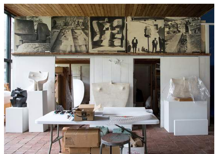
Nivola studio in Springs, NY

For further information and reproduction quality images contact Morgana Tetherow-Keller at 631 324.5016 or morgana@drawingroom-gallery.com