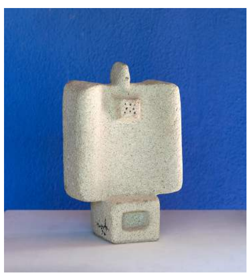
M25, 1970 7 1/2 x 4 7/8 x 3 1/4 inches