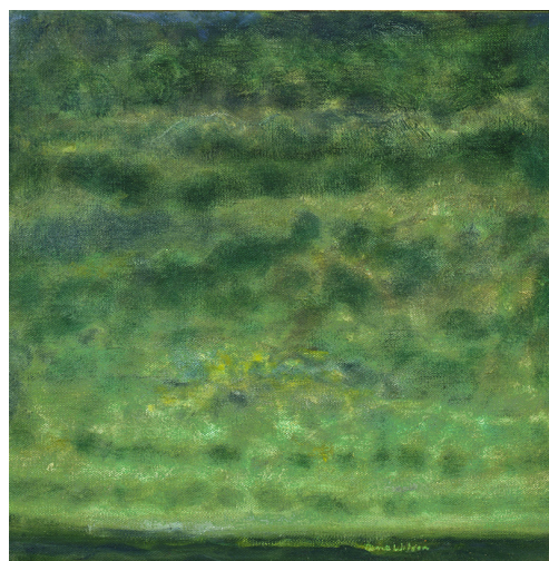
Jane Wilson, Green Twilight , 2001, oil on linen, 18 x 18 in

In Green Twilight , mottled clouds bear down on a narrow belt of land. Brooding, ethereal and incandescent, Wilson's painting invokes both the foreboding and the voluptuousness of natural phenomena.