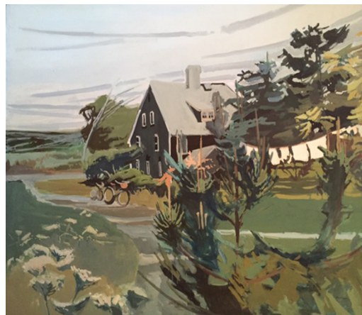
Robert Dash, Monday Morning (laundry) , 1972, acrylic on canvas, 60 x 70 in

In Monday Morning (laundry) , a simple farmhouse anchors the image field mid-ground. Flanked by pines and maple trees, a line of white sheets dips across the yard as it echoes the striated clouds above.