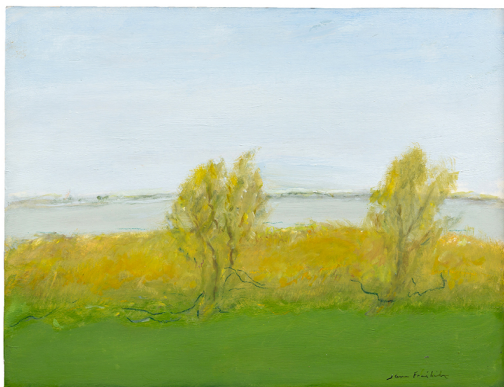
Jane Freilicher, Some Trees , 2007, oil and paper on board, 14 x 17 in

Acclaimed for the astute critical voice he shared in art writings for The Nation and Art News , Fairfield Porter (1907-1975) offered the world not only keen literary discourse but an influential body of paintings and drawings. His preferred subjects included portraits of friends and family, rural landscapes of coastal Maine and Long Island, and understated interior and backyard views of his 1840s colonial home on Southampton's Main Street. Inspired by the French Intimist painters Édouard Vuillard and Pierre Bonnard, Porter's work shared with theirs a muted palette and rigorous pictorial structure. Over time, Porter's mode of representing observed reality became increasingly reductive while reveling in sumptuous brushwork. This characteristic fluidity is also reflected in the ink drawings on view, which capture both the grand and the ordinary. From studies of the sea to a bustling village parking lot, Porter's command of line integrated visual candor, immediacy and compositional finesse.