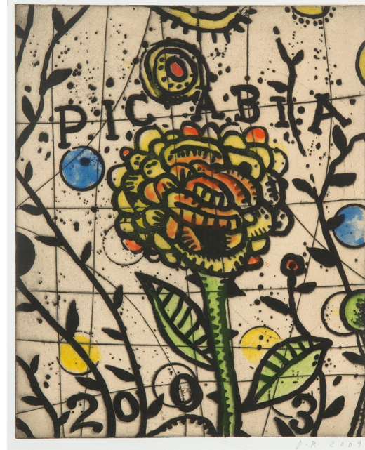
Picabia Portrait, 2009 aquatint, dry point, chine collé, watercolor, 11 5/8 x 9 3/8 in

The Drawing Room in East Hampton is pleased to present DAN RIZZIE Editions / Variations , on view July 9 through August 3, 2015. This is the first exhibition to focus on the innovative prints Rizzie has created in collaboration with master printers at renowned etching and lithography workshops over the last 25 years. Exploring printmaking with his characteristically inventive approach to process, Rizzie turns each intaglio, woodcut or lithography project into an archeological experience. Building each print image from layers of intricately worked plates and adding hand coloring and collage, the artist improvises subtle techniques to preserve the spontaneity of his eclectic vision.