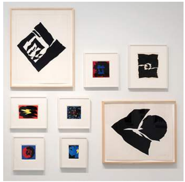
Installation view at The Drawing Room

His work is represented in many public collections, among them the Museum of Modern Art, the Art Institute of Chicago, the Whitney Museum of American Art, the Walker Art Center and the Corcoran Gallery of Art.