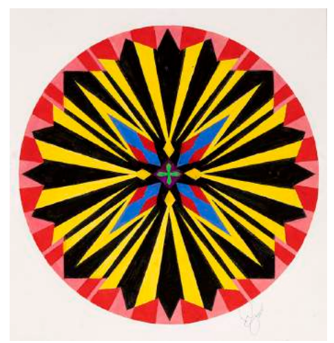
Yellow/Black Tondo, 2007, 12 1/2 x 11 3/4 in

For further information and reproduction quality images contact Morgana Tetherow-Keller at 631 324.5016 or morgana@drawingroom-gallery.com