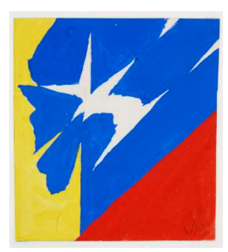
Red Corner II, 1963, 4 1/2 x 4 inches

From July 5th through August 5th, 2019, The Drawing Room is pleased to present an exhibition that highlights formal relationships between Jack Youngerman's works on paper from the 1950s and 1960s and ink drawings and gouaches of the past decade. In pairing early compositions that explore the dynamic interplay between positive and negative shapes with recent paintings on paper that mine intricate variations in radial symmetry, the show offers viewers a rare opportunity to identify consistent hallmarks that unify the oeuvre of one of the East End's most esteemed artists. A small selection of beach stones painted with polychromatic patterns reveals a whimsical interval within the artist's rigorous practice, and another echo of his vibrant geometric structures.